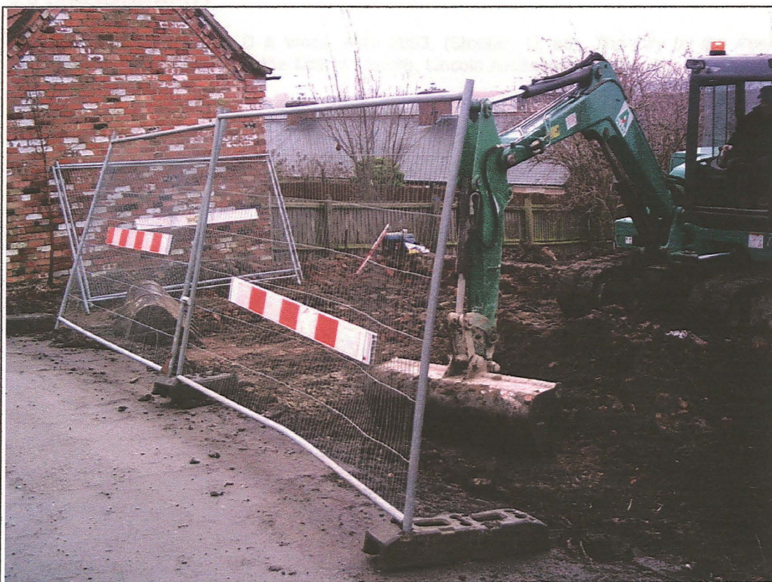
Plate 1: General view looking south-east during groundwork.

The archaeological record was secured by means of trench-side notes, scale drawings and photographs.