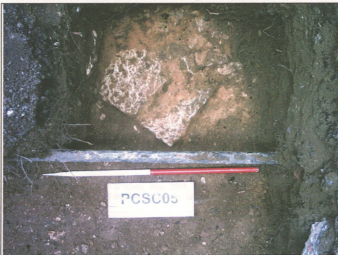
Plate 1: Limestone structure [004] (possibly a buttress) looking east (Scale is 1m – also see Fig. 2, Plan 1).

The archaeological record was secured by means of trench-side notes, scale drawings and photographs.