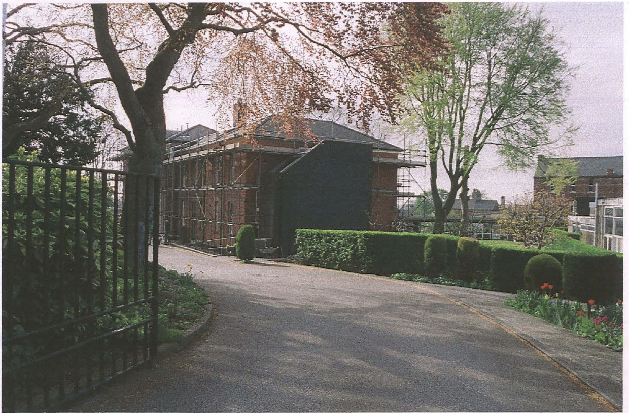
PI. 1 The Mount, Wragby Road, Lincoln, looking east.