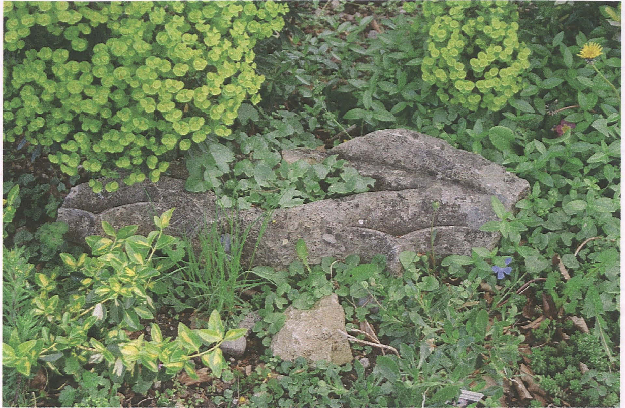
Pl. 5 Architectural fragment in garden border at The Mount.