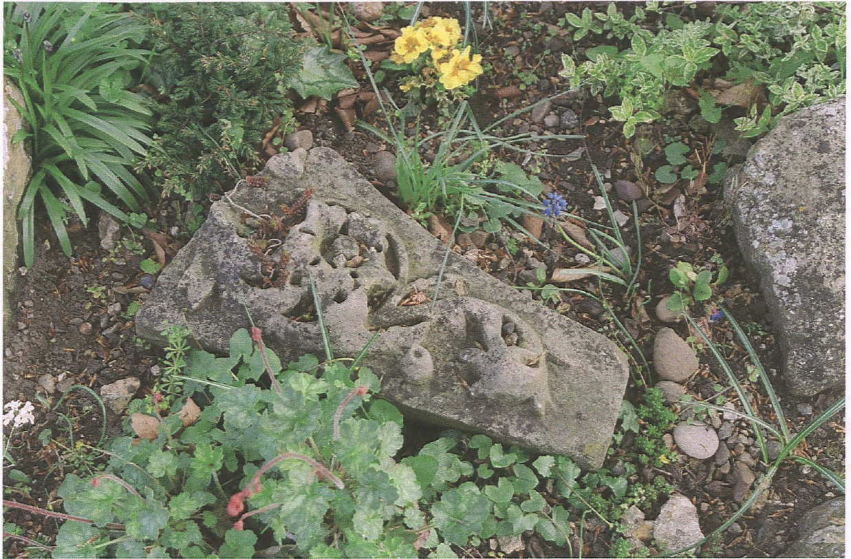
PI. 7 Architectural fragment in garden border at The Mount.