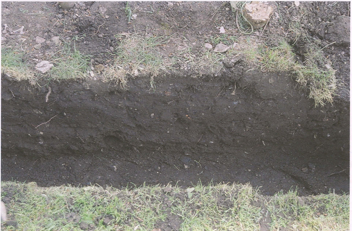
PI. 3 Deposits visible in the retaining wall trench.