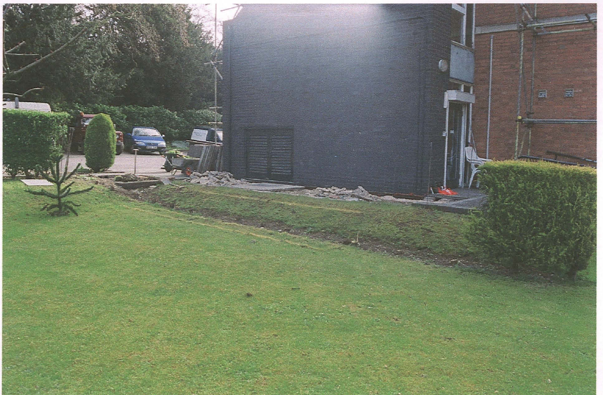
PI. 2 Location of the retaining wall trench, The Mount (looking north-east).