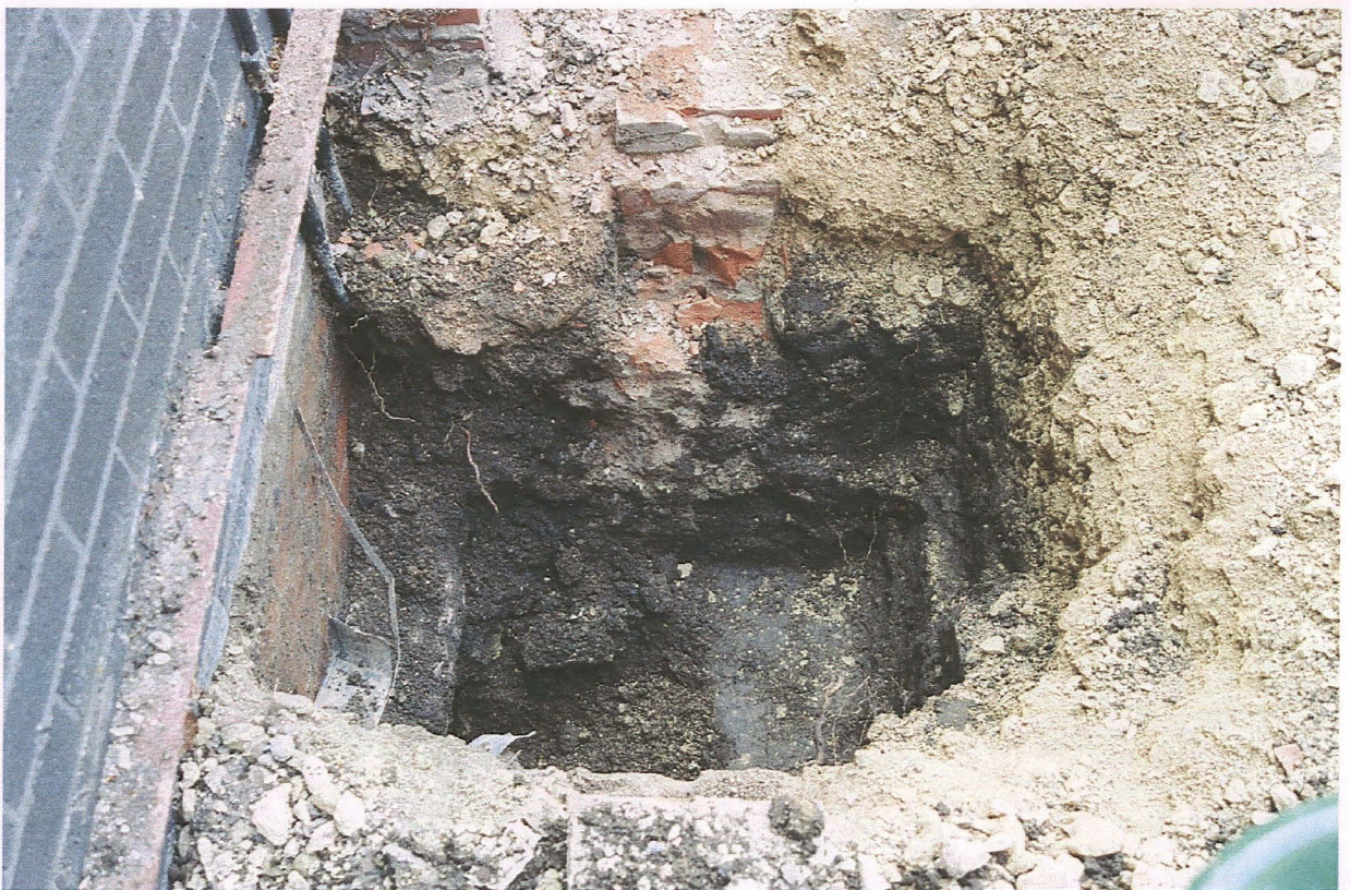
PI. 4 Trial hole for the extension wall foundation, revealing thick deposits of disturbed ground.