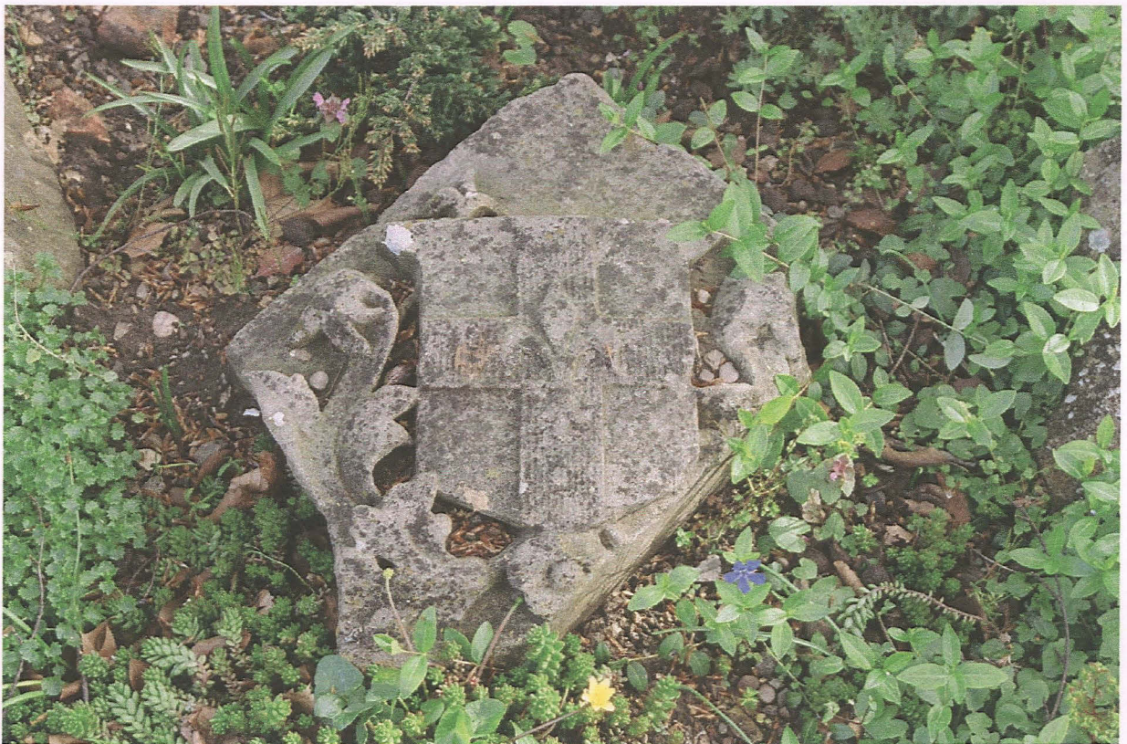
Pl. 6 Architectural fragment with City of Lincoln crest, in garden border at The Mount.