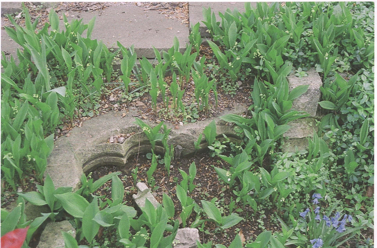
PI. 8 Architectural fragment in garden border at The Mount.