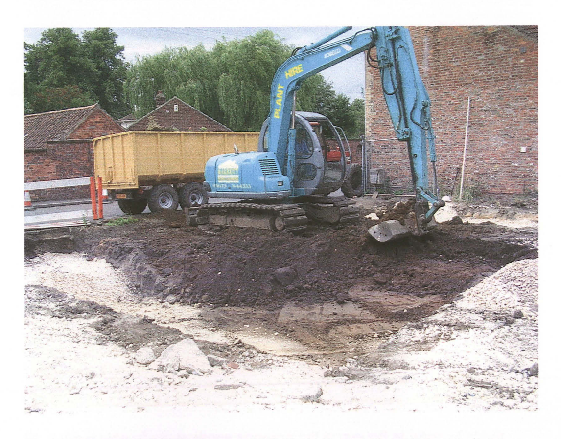
Pl. 2 26/28 Dear St Market Rasen, general view of the site looking south-west