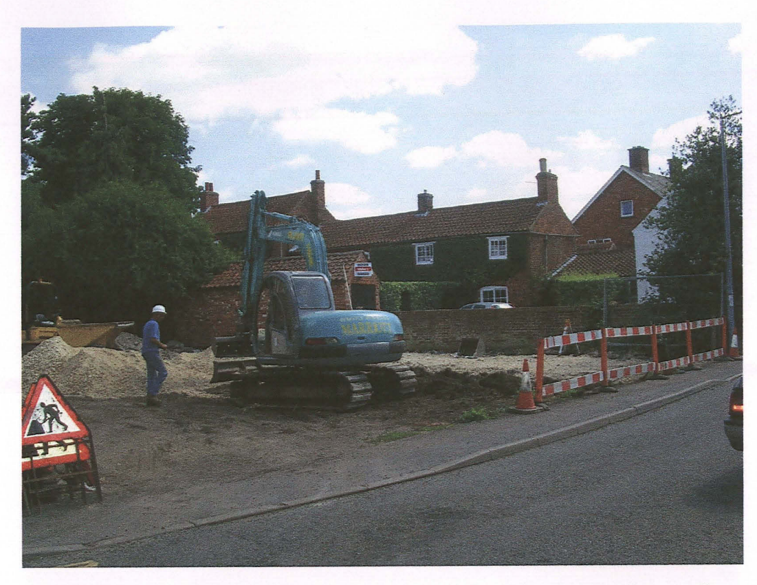
Pl. 1 26/28 Dear St Market Rasen, general view of the site looking north-east.