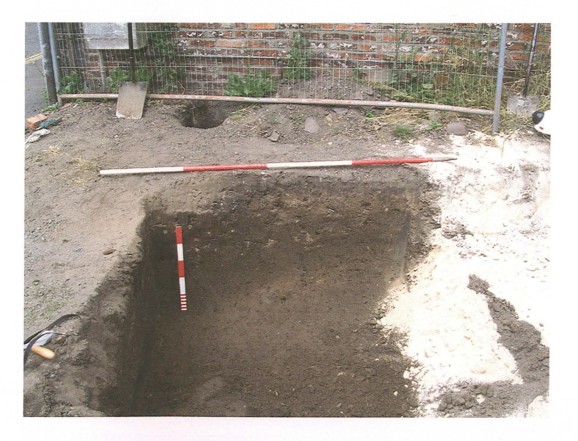
PI. 4 West side of excavations showing fall in ground at edge of street. Scales 2m and 0.50m