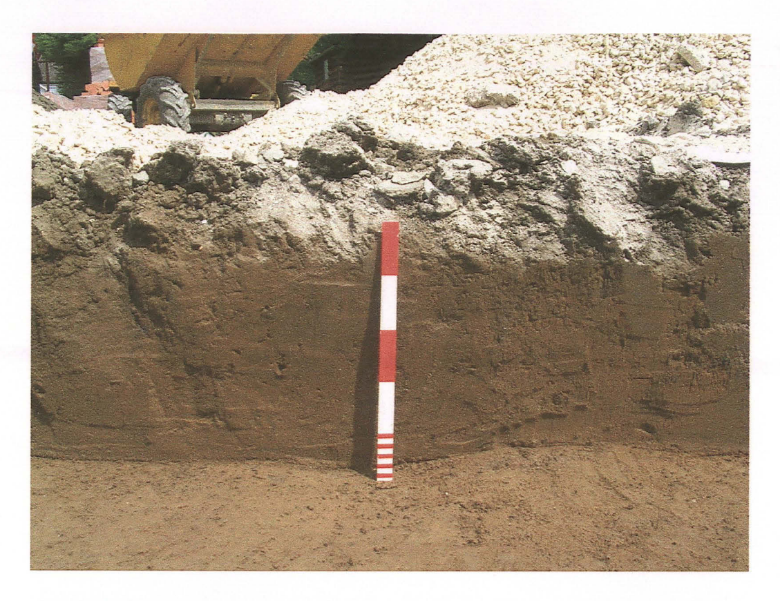
Pl. 3 Typical section at rear of excavations, looking north. Scale 0.50m