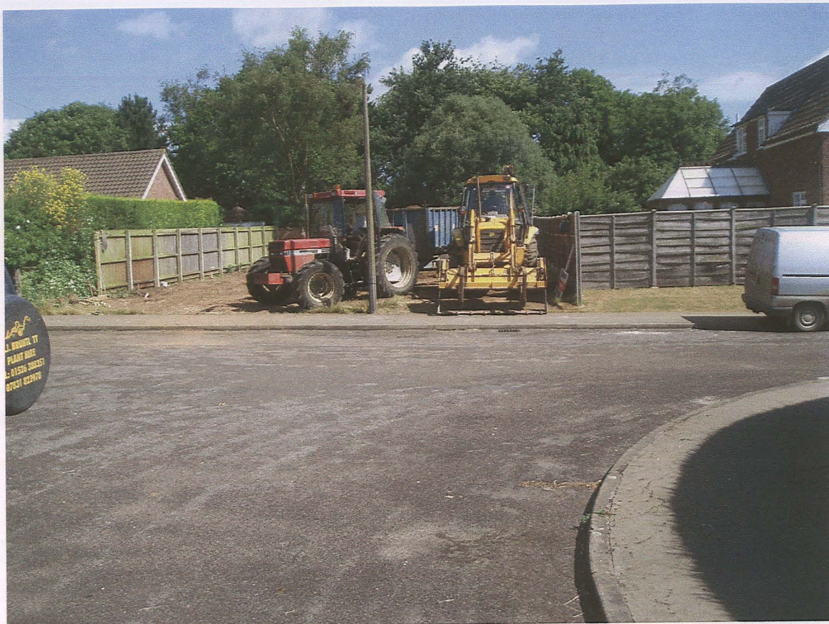
Pl. 1 General view of the site before the groundworks began