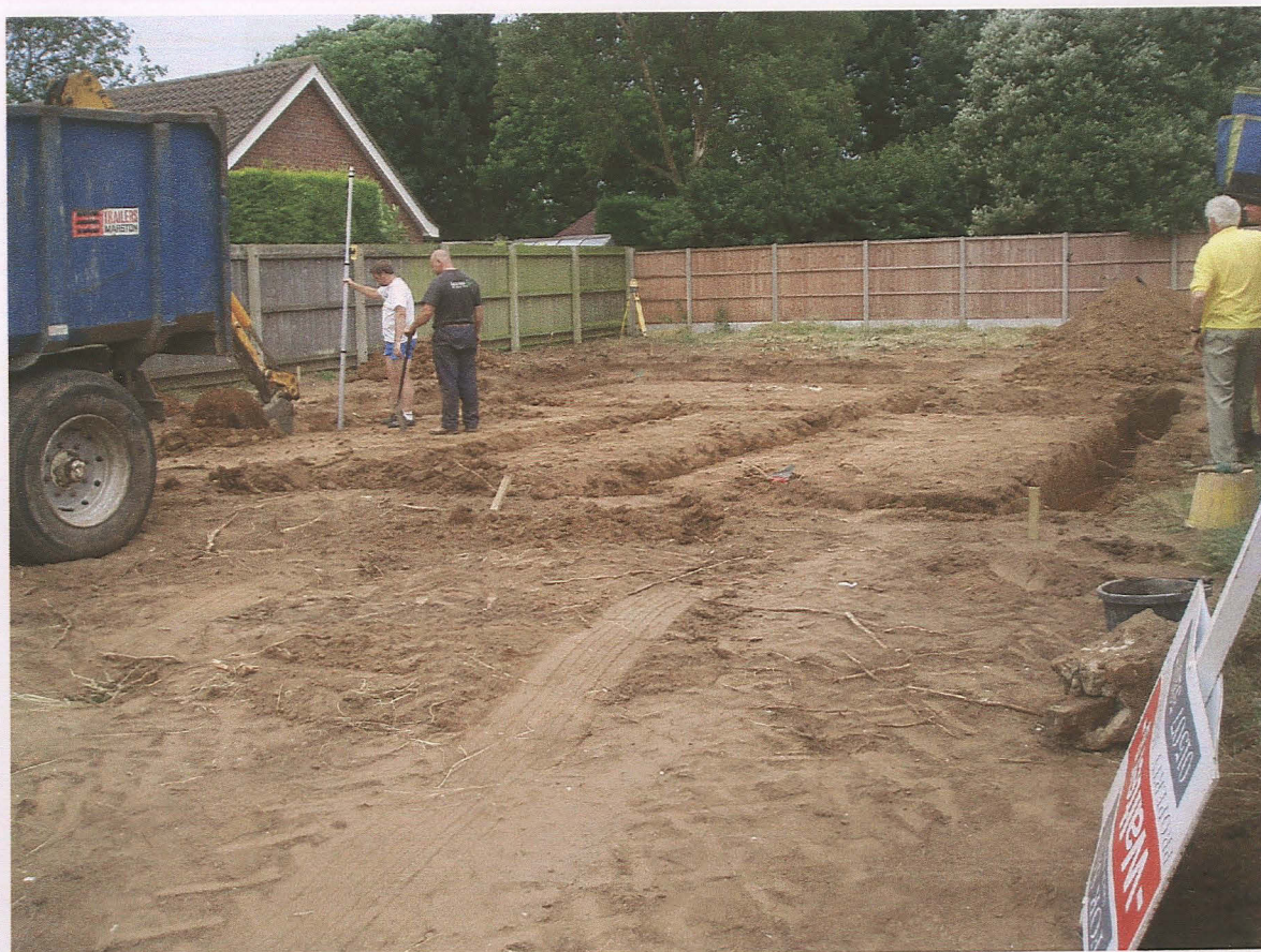
Pl. 2 General view of the site during excavation of the foundation trenches.