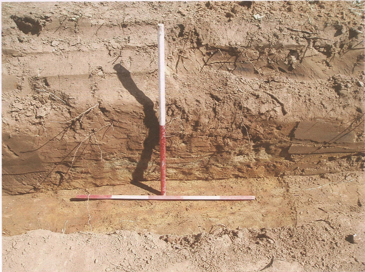
Pl. 3 The south facing section of the northern-most foundation trench. Scales 1m.