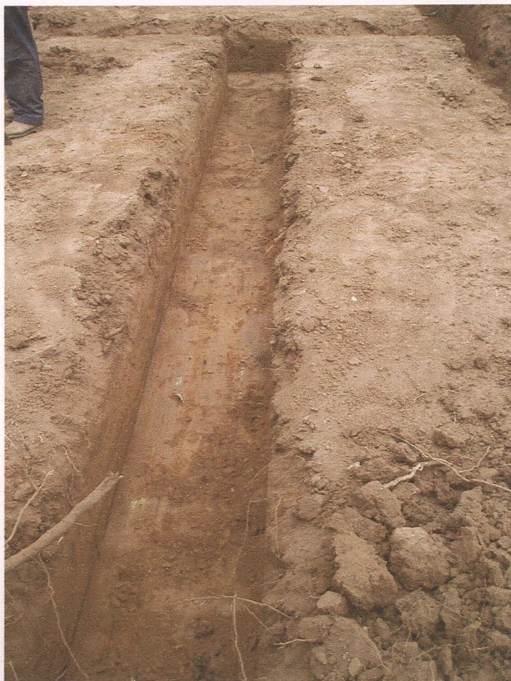
Pl. 4 The central n/s foundation trench with the sand natural visible in the base.