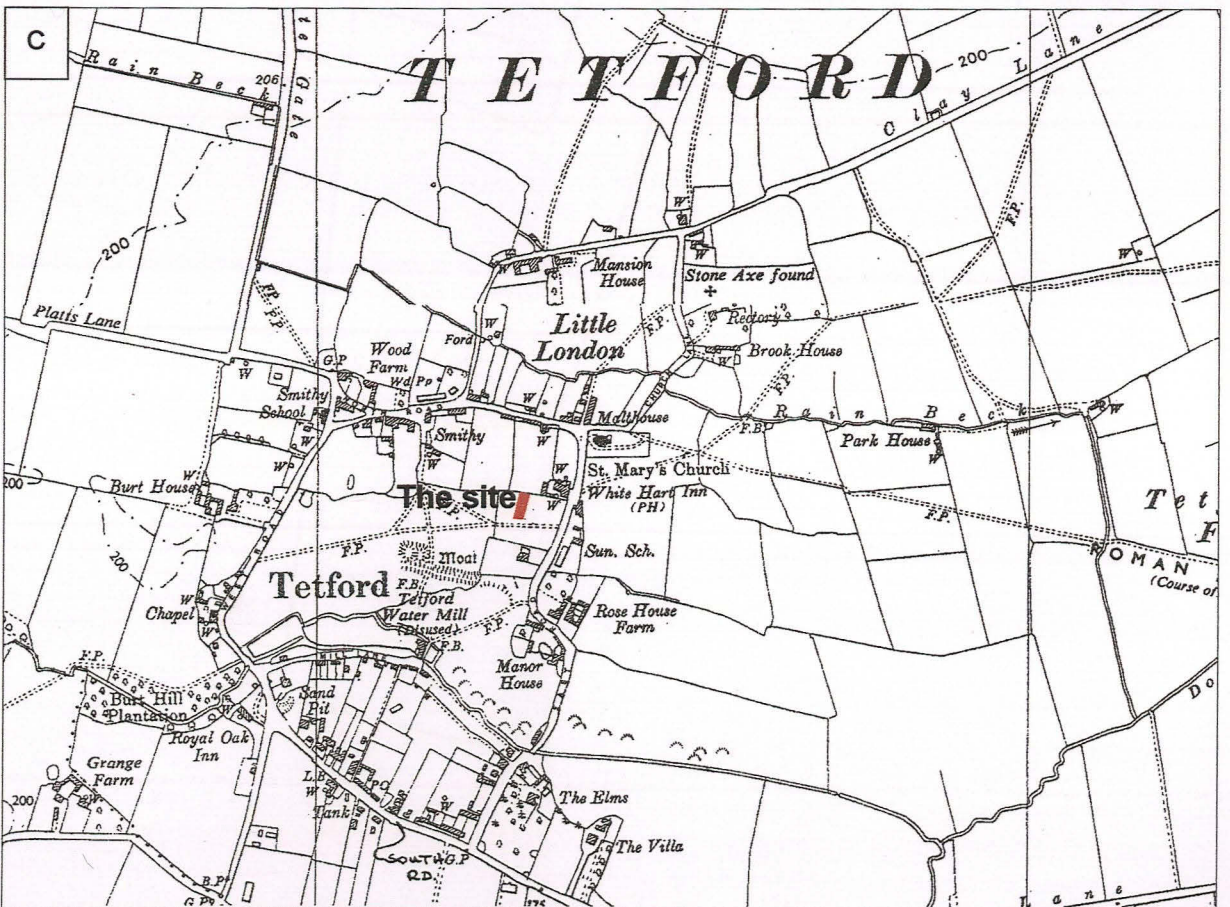
Fig. 1 Location of the site behind Endwood Cottage, Tetford, Lincs.