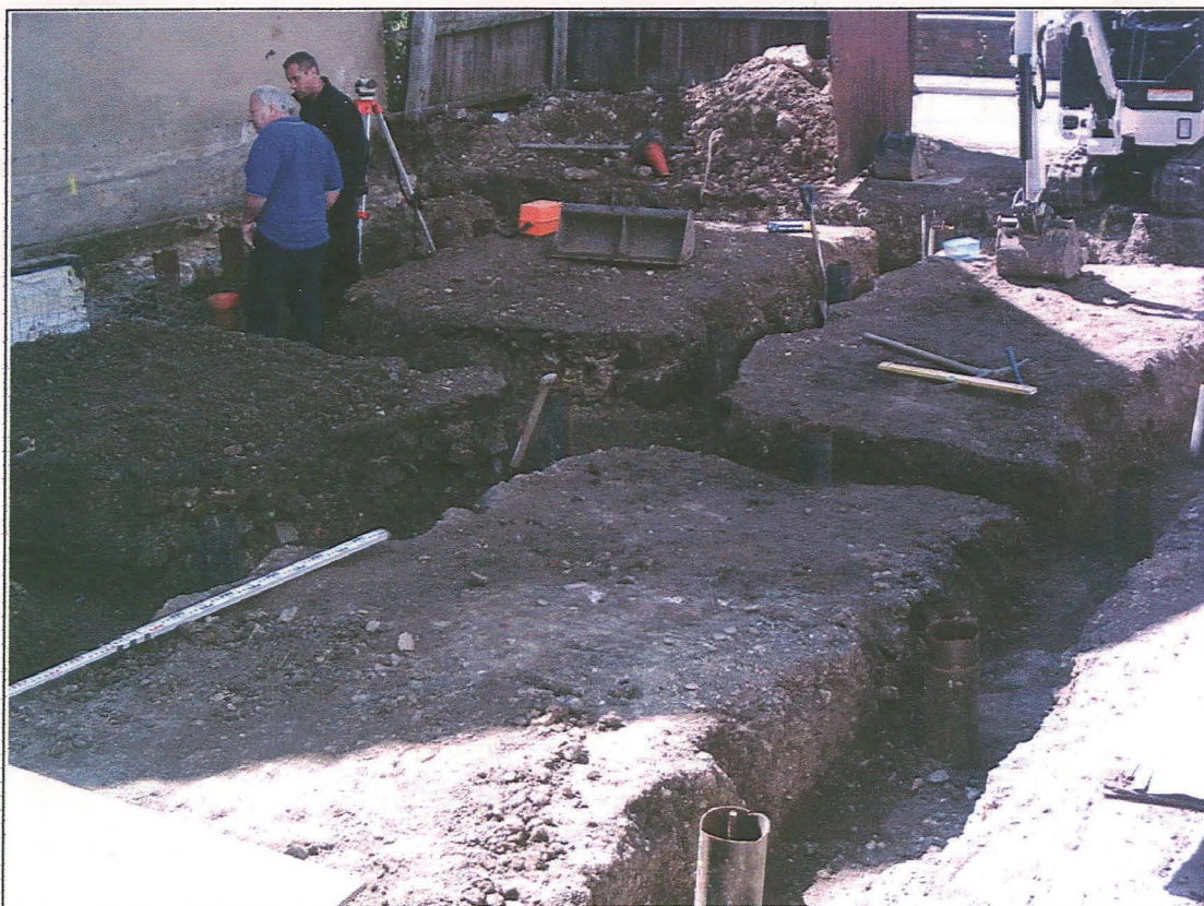
Plate 1: General view of the site looking south-west.

In conclusion, although the results of this watching brief are of limited interpretive value and provided little information regarding the archaeological content of the site, an overall enhancement of knowledge of the area has been achieved with regard to the survival and extent of archaeological deposits. This information will be of value in future decision making in the management of the archaeological resource in this part of Lincoln.