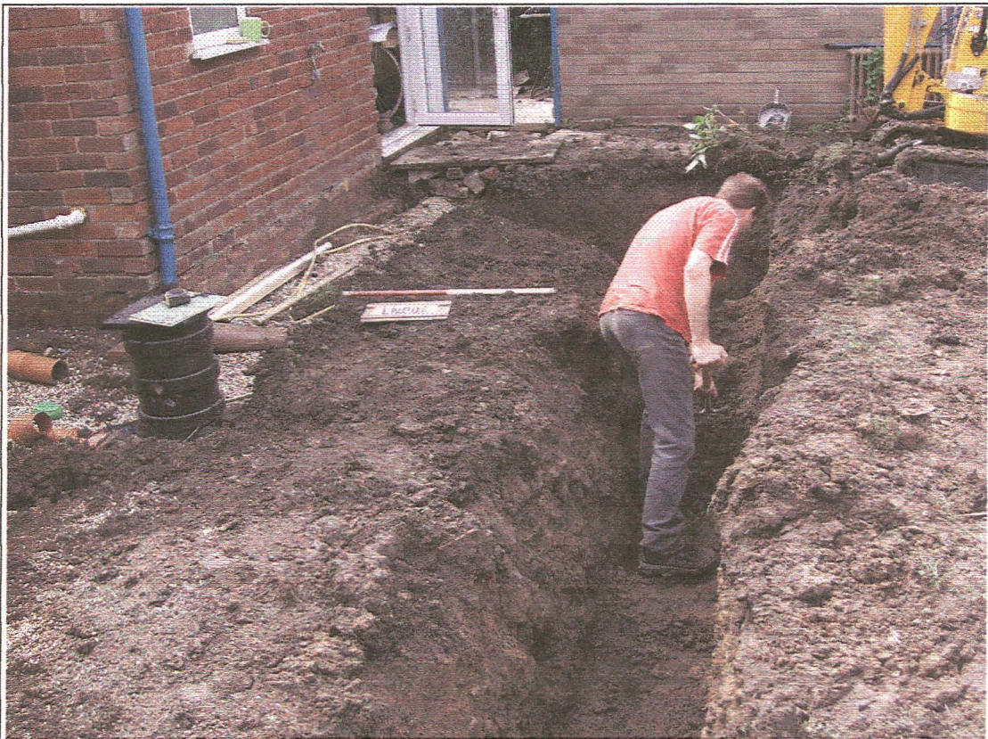
Plate 1: General view looking south showing the excavation of the foundation trench (Scale is 1m).

The archaeological record was secured by means of trench-side notes, scale drawings and photographs.