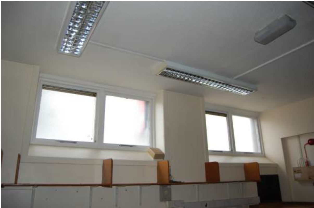
Illus 5 Phase 1 room interior; windows facing onto Fonthill Road