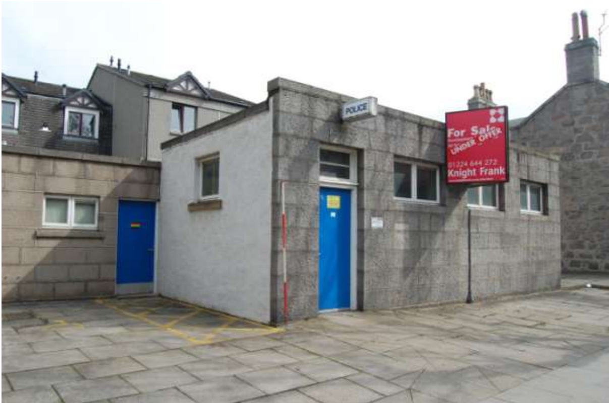
Illus 4 Phase 1 building (right) and Phase 2 (left) (facing NE)