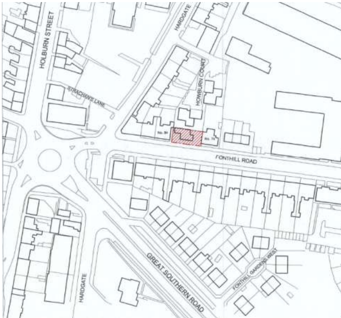
Illus 2 Location plan of former police station

The newly refurbished Police Station in Fonthill Road is now the most modern in Aberdeen boasting separate showers for men and women officers.