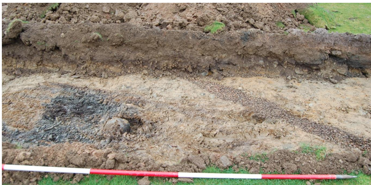
Illus 2 Trench 1: Pea gravel filled trench (F1, right) and tree boll (F2, left)

Three trenches totalling 7% of the c 1 hectare site was carried out using tracked machine with 2m wide ditching bucket on 19 March 2012. The subsoil was a medium brown clayey sand. The topsoil had been truncated in most areas probably during the landscaping for the golf practice area, but original topsoil survived over most of the site. The original topsoil was up to 0.3m deep and the complete depth up to 0.6m. All features recorded dated to the late 20th century and were probably associated with the golf practice range. Several 0.2m wide trenches filled with pea gravel contained plastic drainage pipes: details of all features appear in archive.