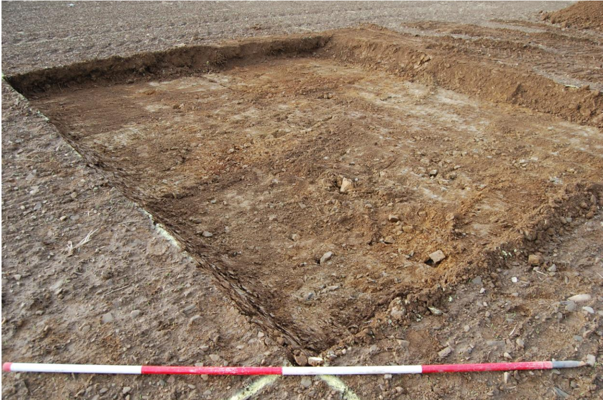
Illus 3 Trench 1 facing NE