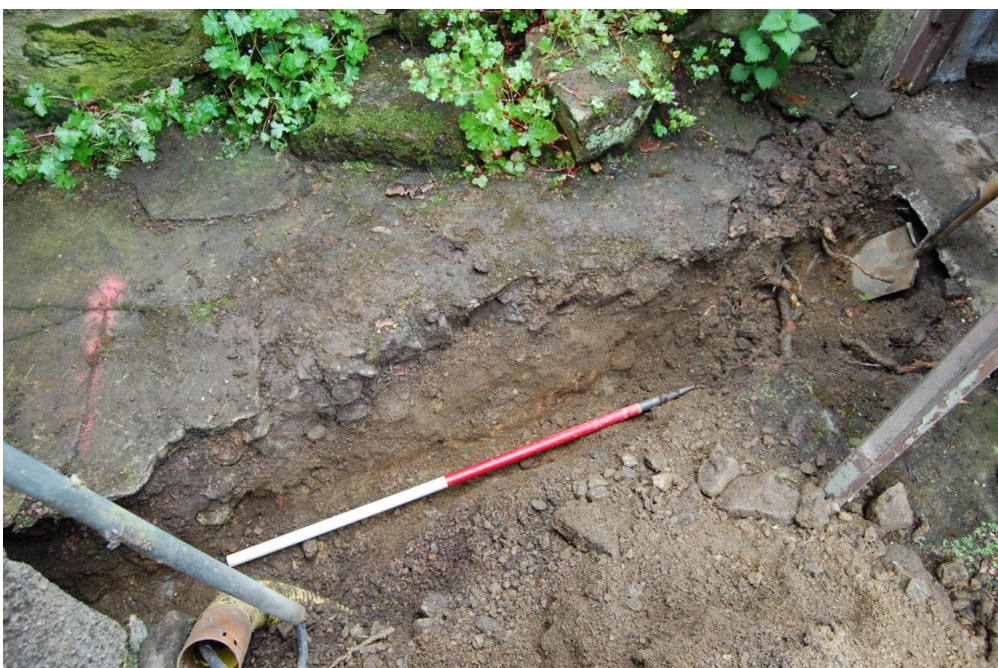
Illus 4 Trench 2 facing NW

Trench 2 was hand-dug, 2m long, 0.5m wide and 0.3m deep between the Coal Store and existing steadings. The ground had been previously disturbed and no finds were recovered.