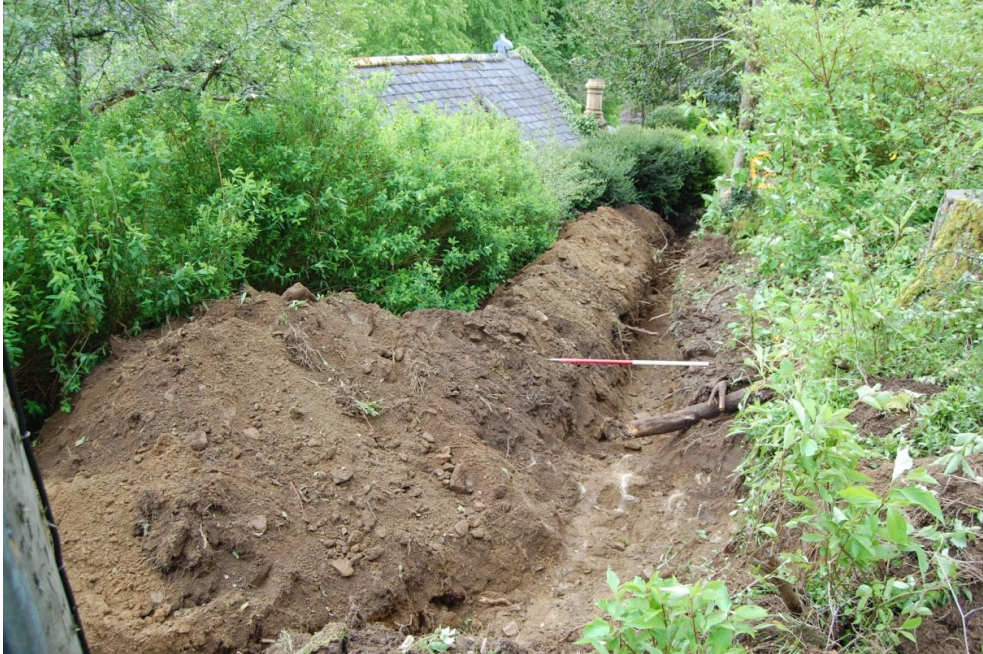
Illus 3 Trench 1 with Laundry Building (left) facing south

Trench 1 was 0.5m wide and 0.6m deep and was located west of the Laundry Building past the existing electricity transformer and east to the Coal Store. It was dug with a mini-digger. There was 0.2-0.3m depth of garden soil with numerous roots from existing trees; no finds were recovered from this layer. Near the existing transformer the bedrock was reached at a depth of 0.5m; it consisted of beds of slaty stone.