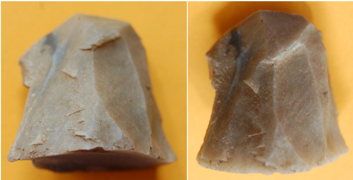
Illus 7 Two faces of the flint core from Trench 2 context 200.