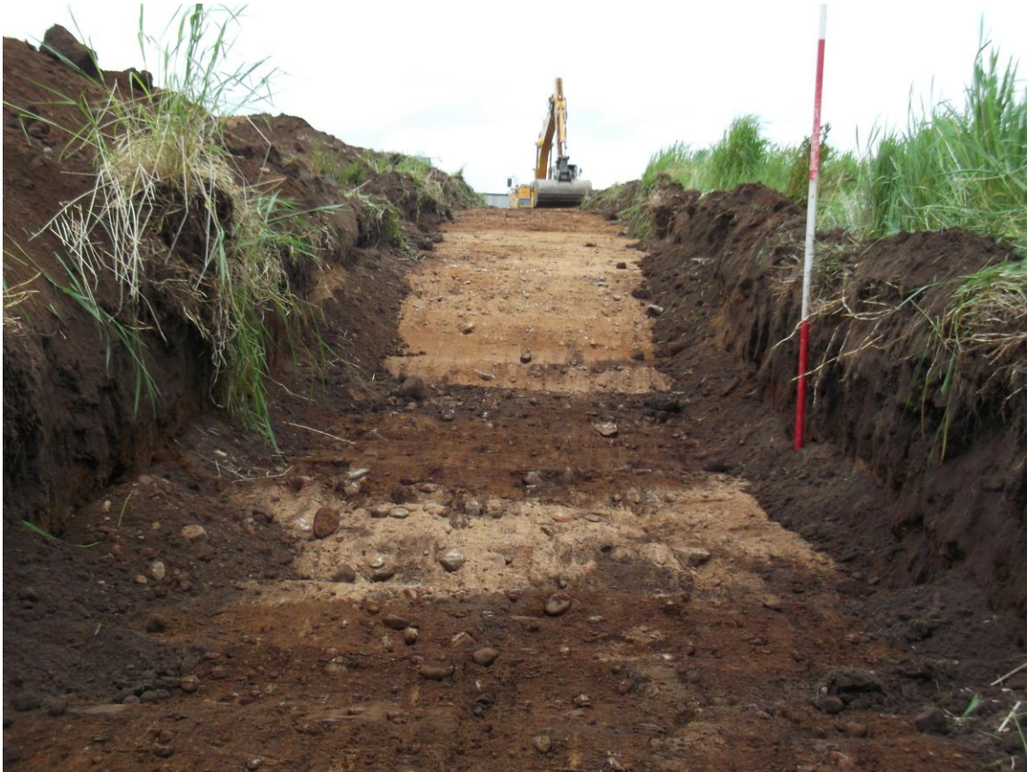
Illus 4 Trench 10 palaeochannel F5 the west bank of former line of Cluny Burn