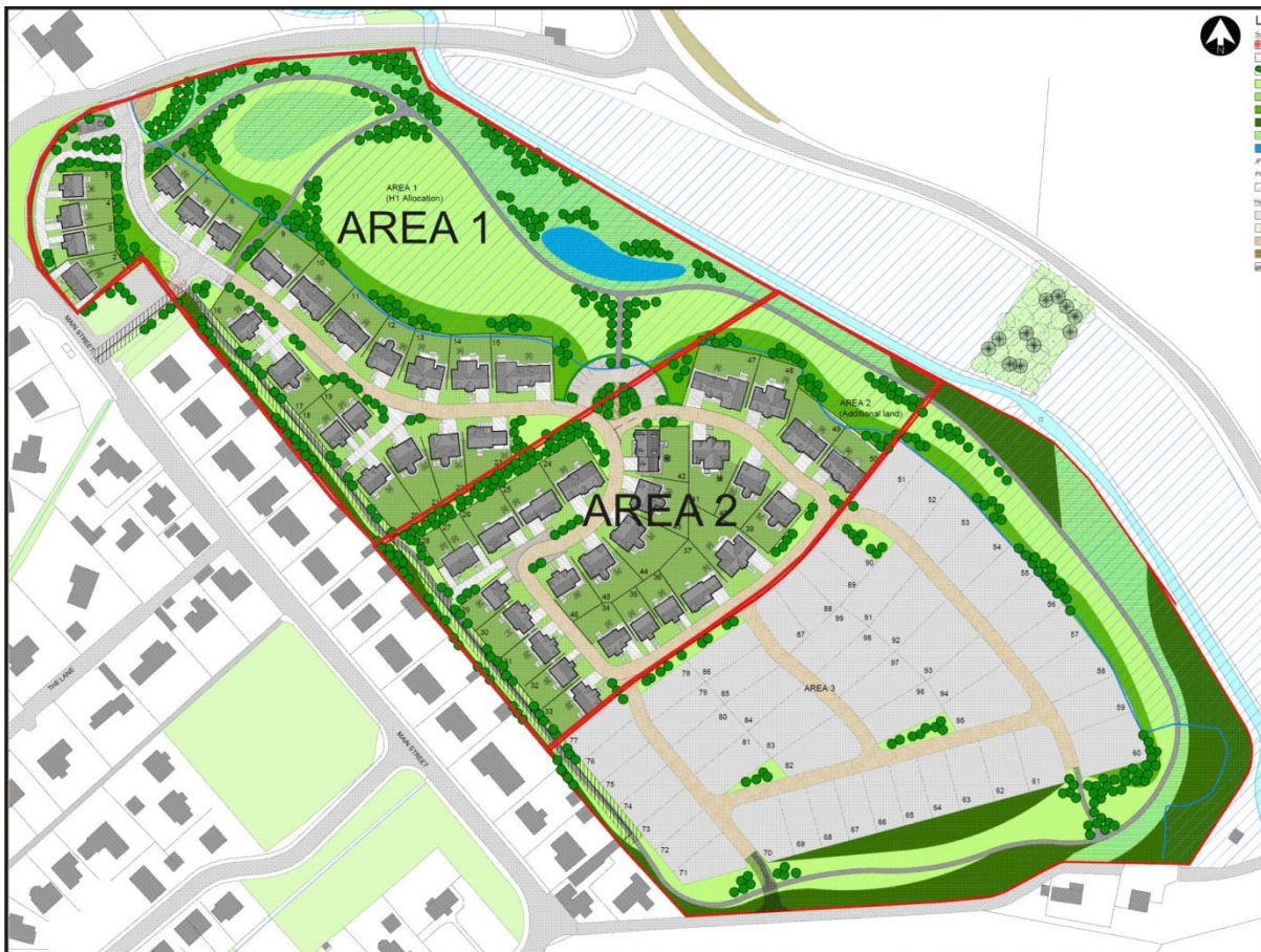
Illus 2 Site layout (copyright Kirkwood Homes Ltd)