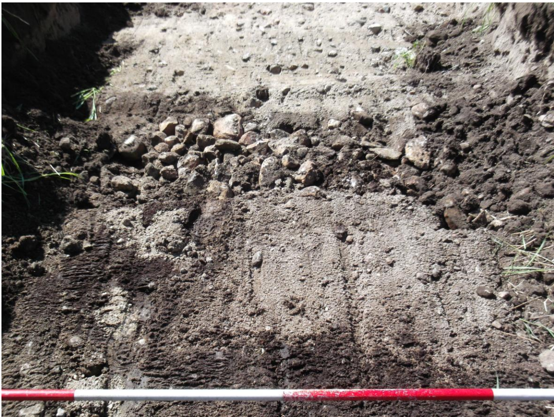
Illus 5 stone drain F1 Trench 3