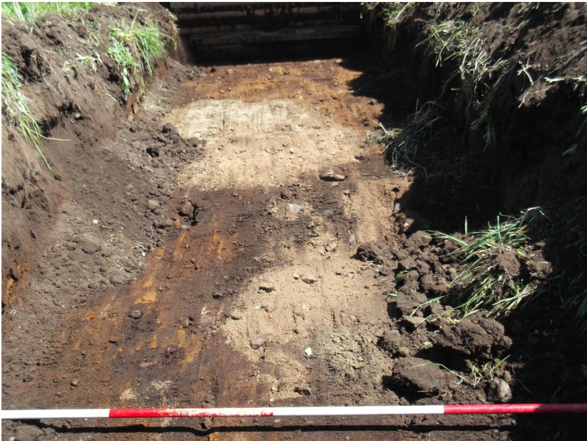
Illus 6 Trench 6 F3 (top) and F4 (bottom) showing china and glass (above ranging rod)