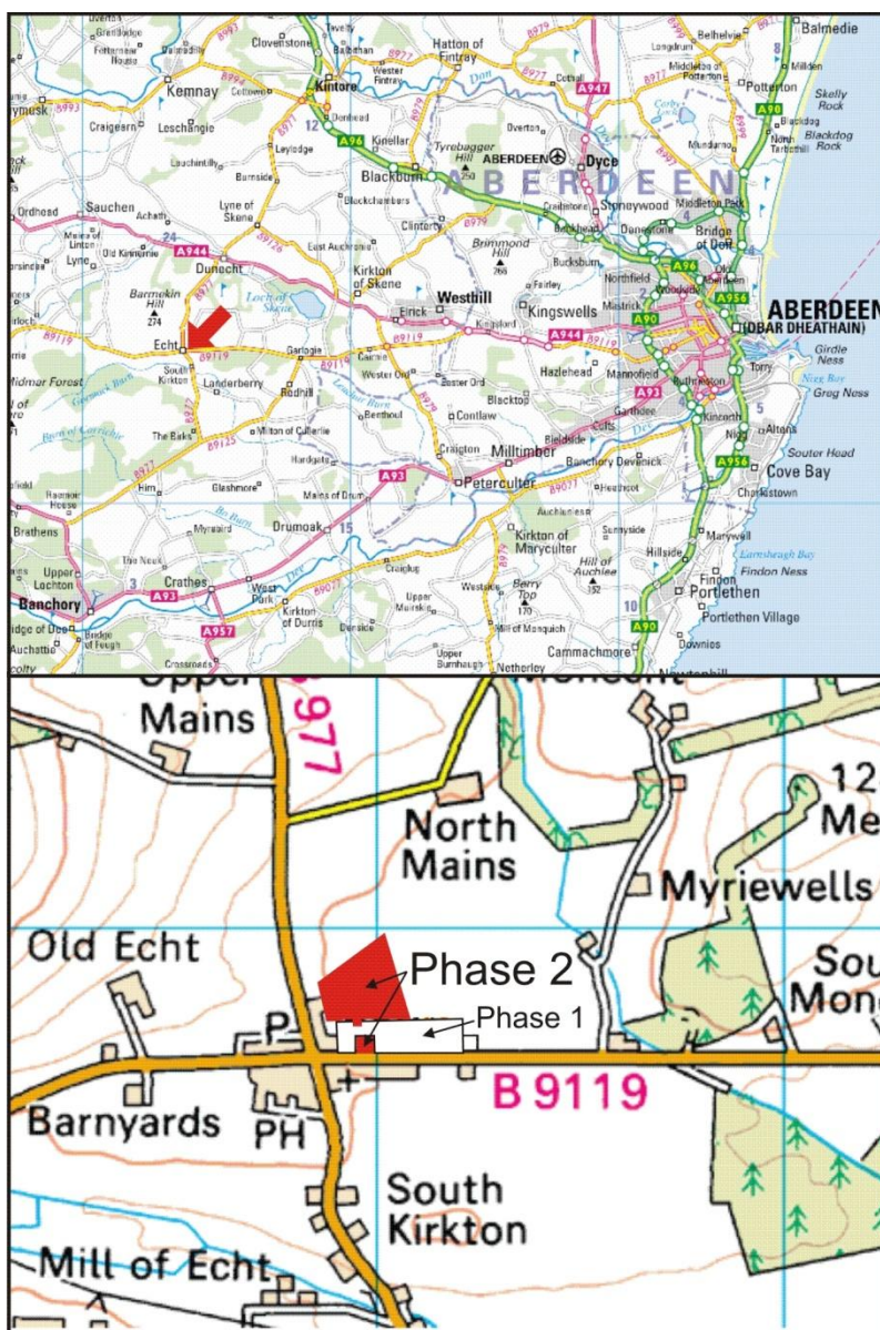
Illus 1 Location plan (Contains Ordnance Survey data © Crown copyright and database right 2013)