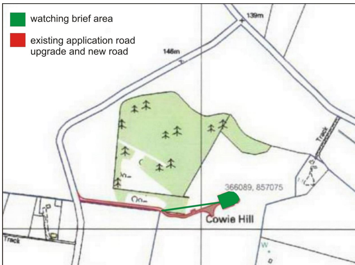
Illus 2 Location of watching brief

An archaeological watching brief was carried out on 22 July 2014 for the new access track, turning area and wind turbine base. The topsoil was 0.1-0.3 m deep within an agricultural field. The turbine base was situated on a rock outcrop with 0.1m topsoil and the track on an east facing rocky slope. No archaeological features or finds were recorded and it is recommended that no further archaeological work is required during the current development.