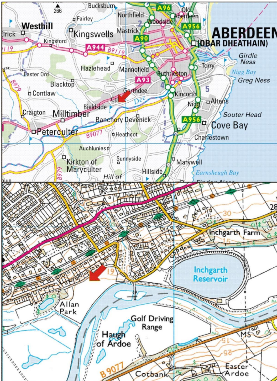
Illus 1 Location plan (Contains Ordnance Survey data © Crown copyright and database right 2014).

The site lies on the south side of Loirsbank Road, Cults on the west side of new residential housing. The site is at NJ 89506 02683 (centred) at 15-20m OD and in the parish of Peterculter. A planning application P111153 was passed by Aberdeen City Council on 13 January 2012 with a standard archaeology condition (condition 1); Aberdeen City Council require a watching brief during the work.