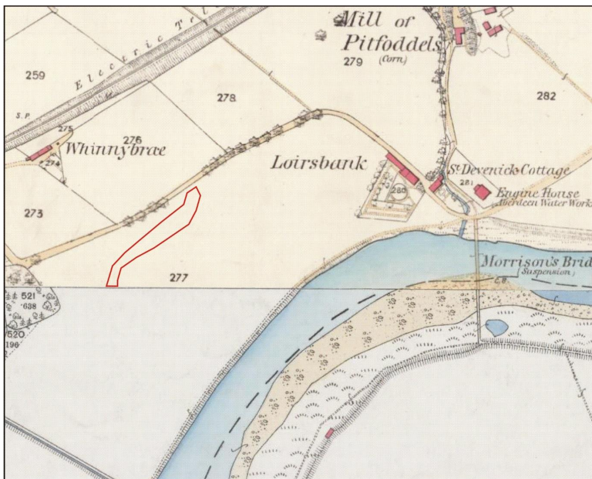
Illus 3 First Edition OS map with approximate area of site outlined in red Kincardine Sheet III.8/12 (Banchory Devenick/combined) Survey date: 1865 Publication date: 1868