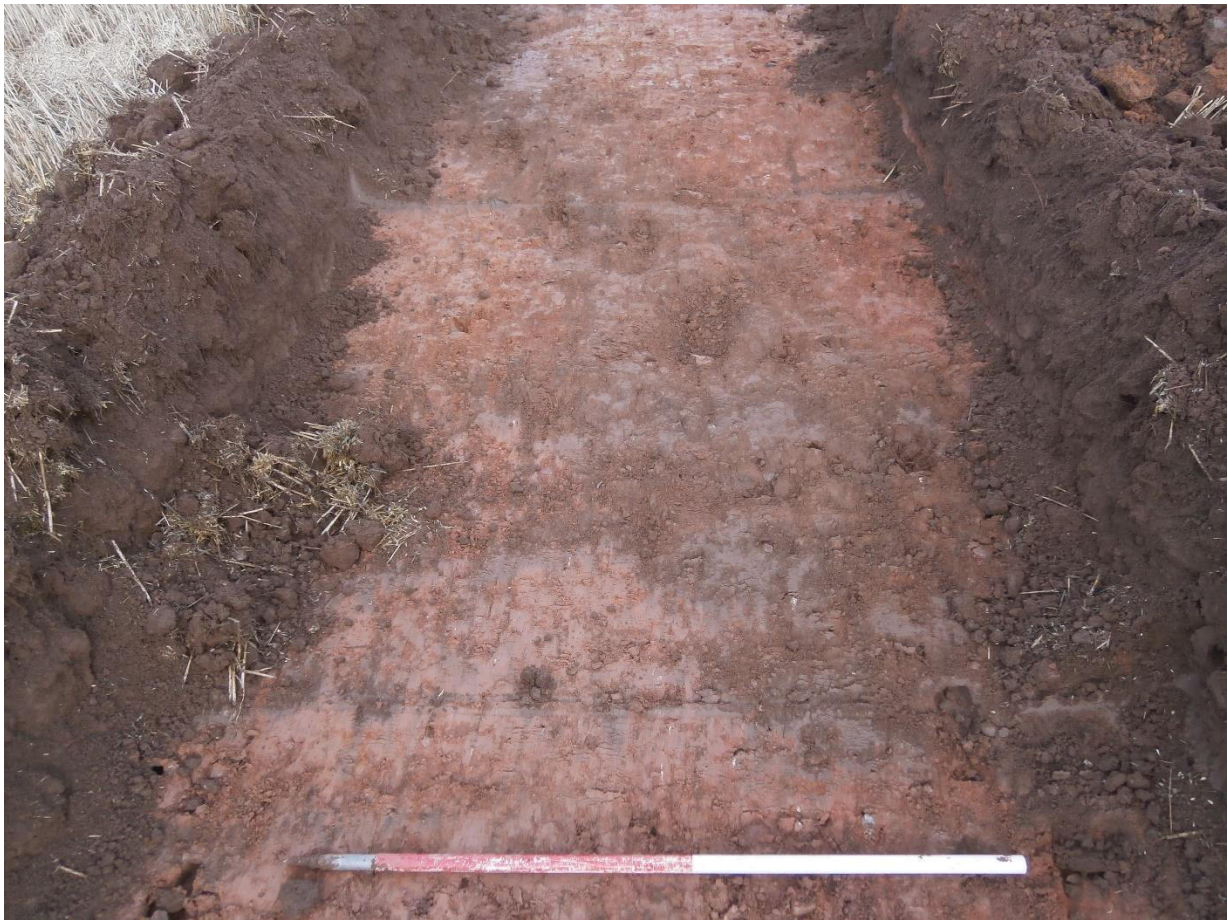
Illus 3 Trench 12 NNW-SSE furrow; facing N