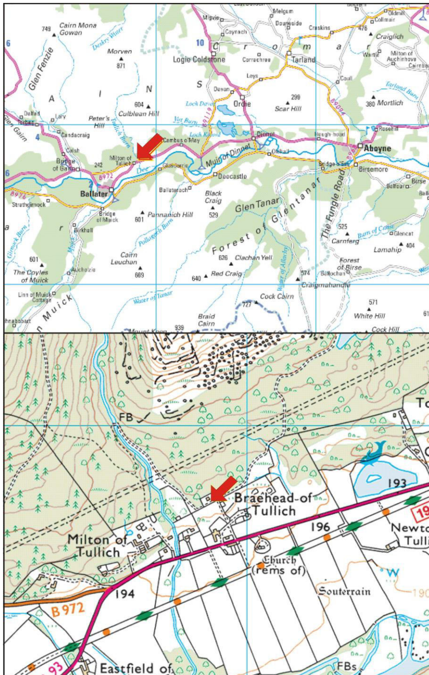
Illus 1 Location plan (Contains Ordnance Survey data © Crown copyright and database right 2015)