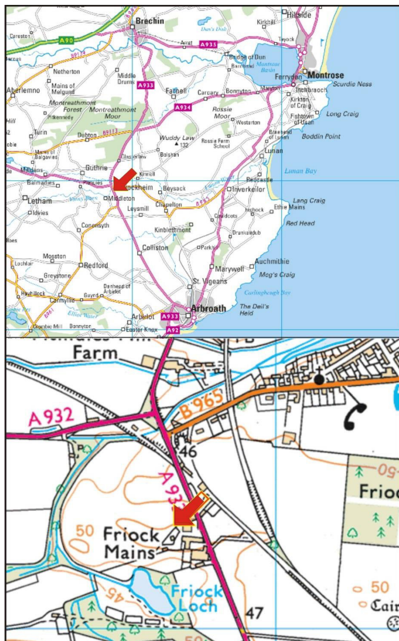
Illus 3 Location plan (Contains Ordnance Survey data © Crown copyright and database right 2017)