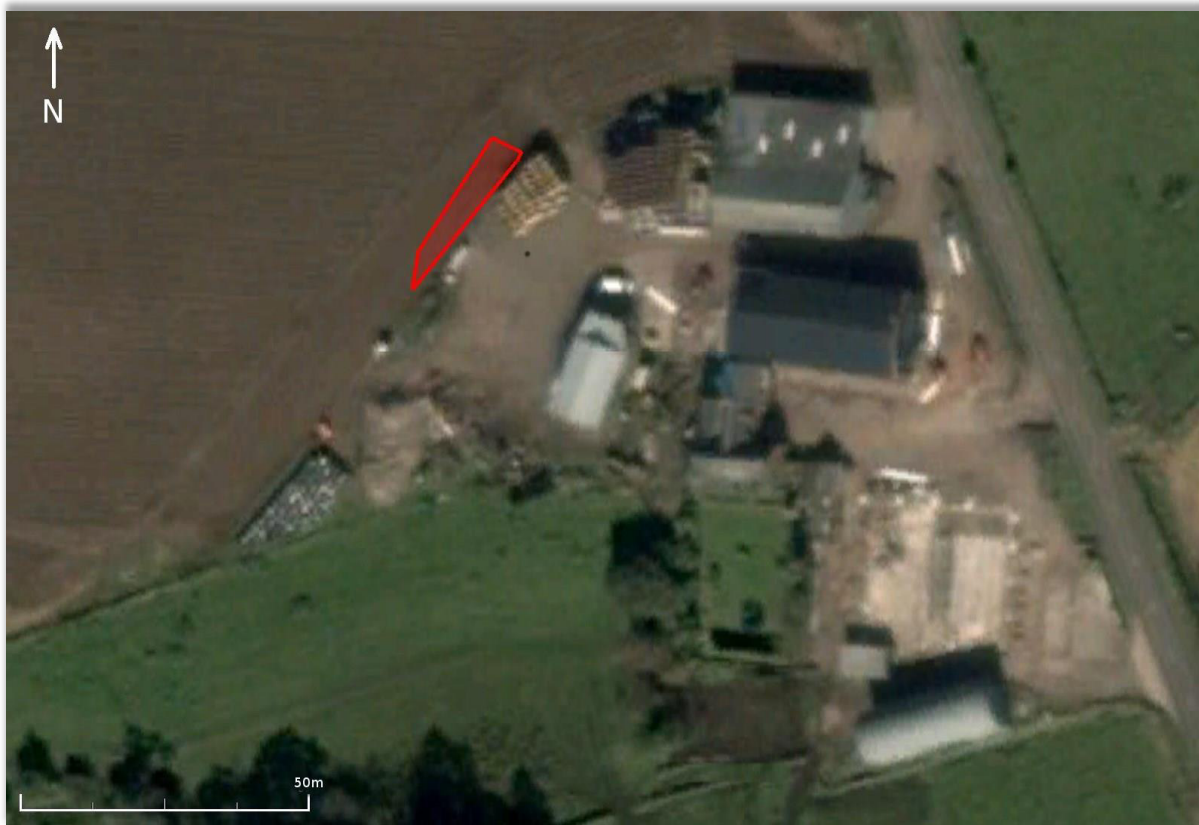
Illus 3: GPS location of soil strip shaded in red.