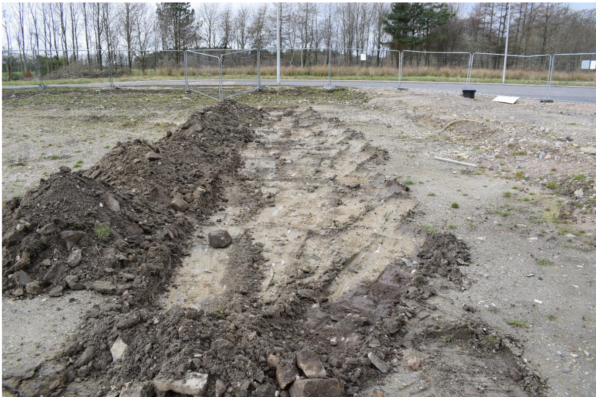
Illus 3 Area scraped to check subsoil; facing W

No finds or features were recorded and it is recommended that no further archaeological work is required during the current planning application.