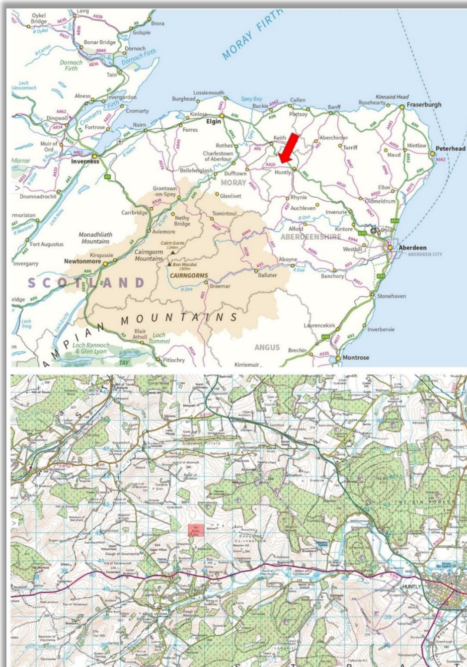
Illus 1 Location plan (Contains Ordnance Survey data © Crown copyright and database right 2019)