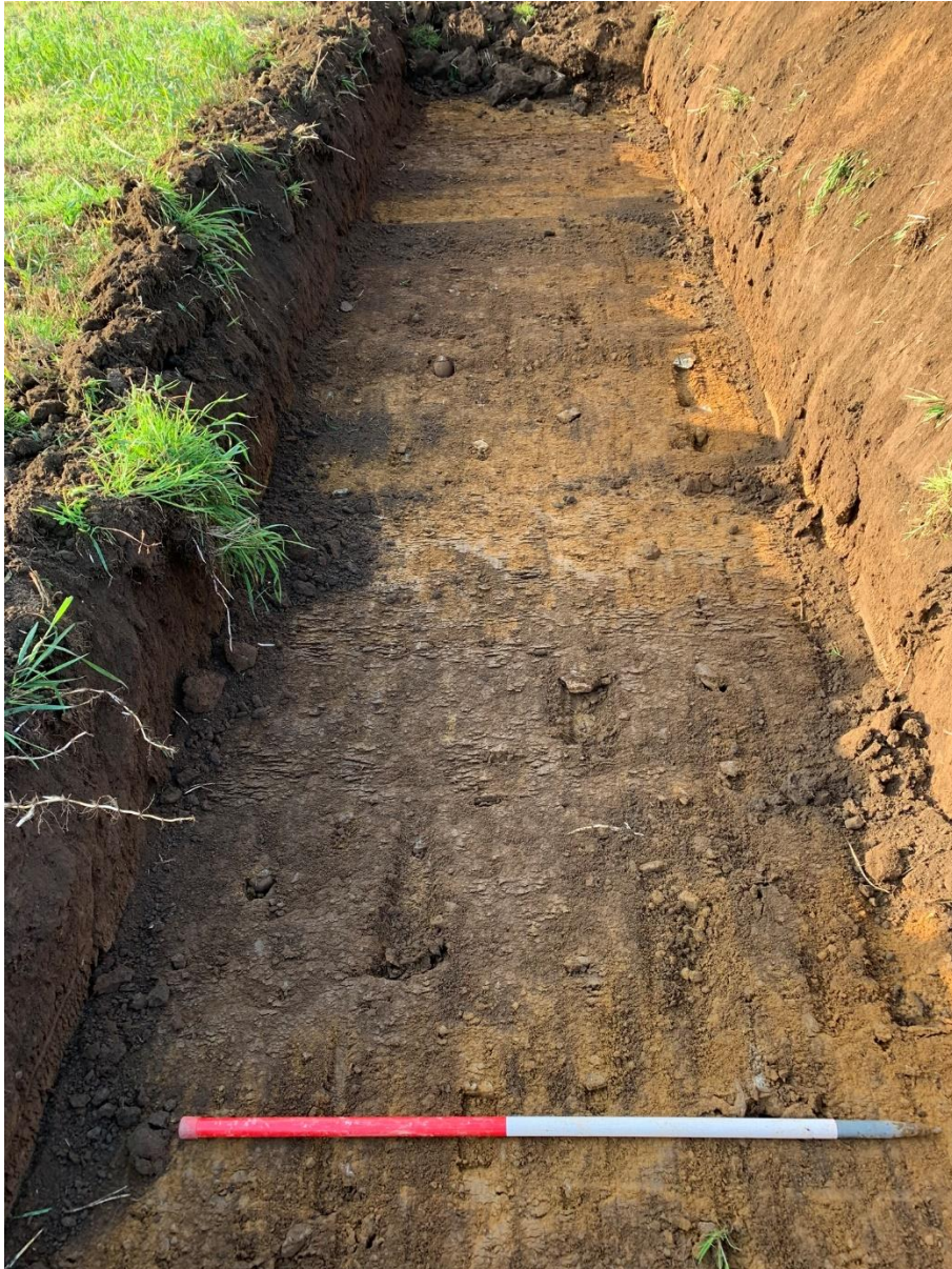
Illus 3 Trench 1 furrow; facing S