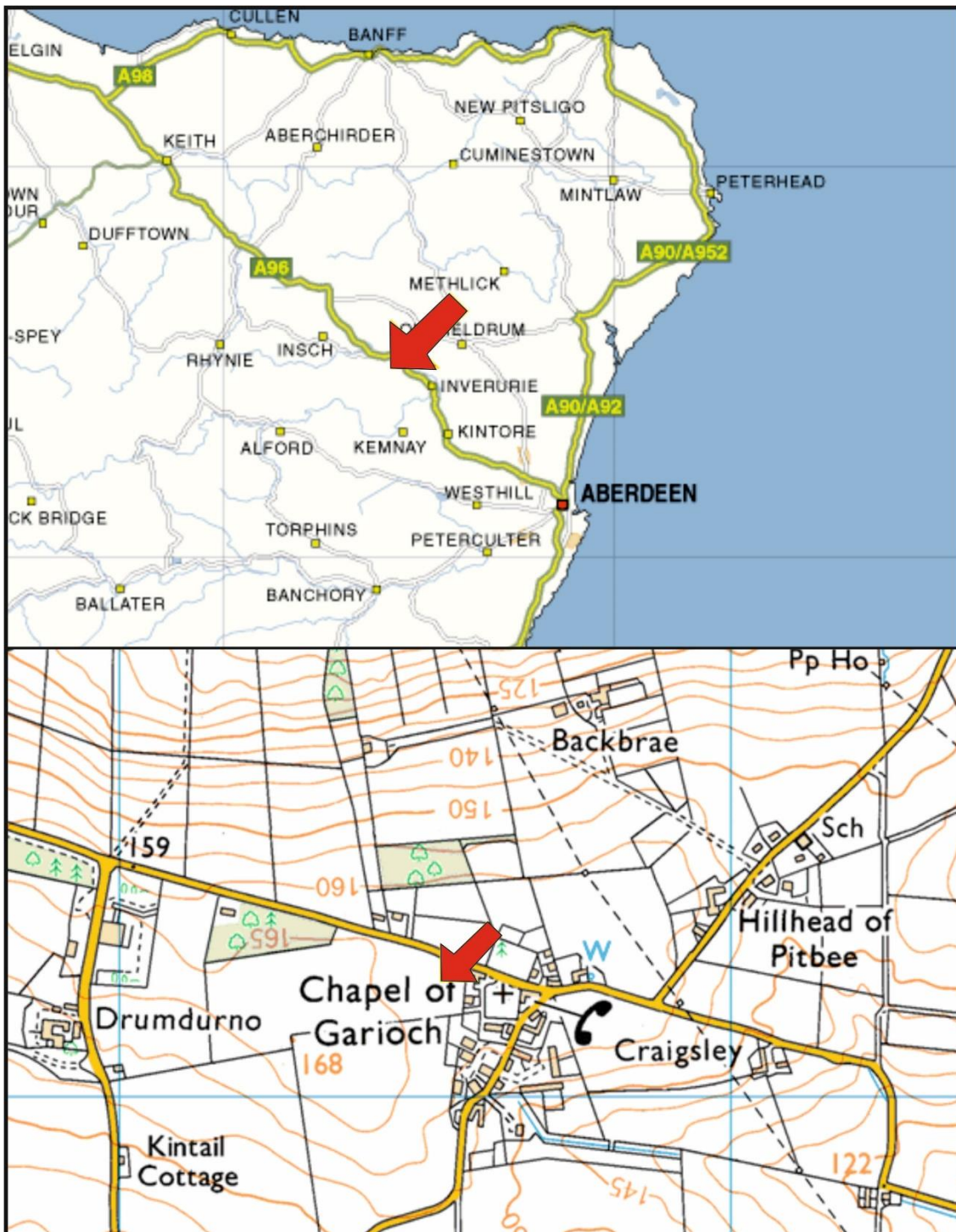
Illus 1 Location plan (Contains Ordnance Survey data © Crown copyright and database right 2019)