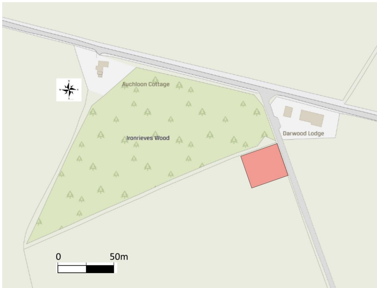
Illus 3 Area of soil strip during the watching brief (Contains Ordnance Survey data © Crown copyright and database right 2019).