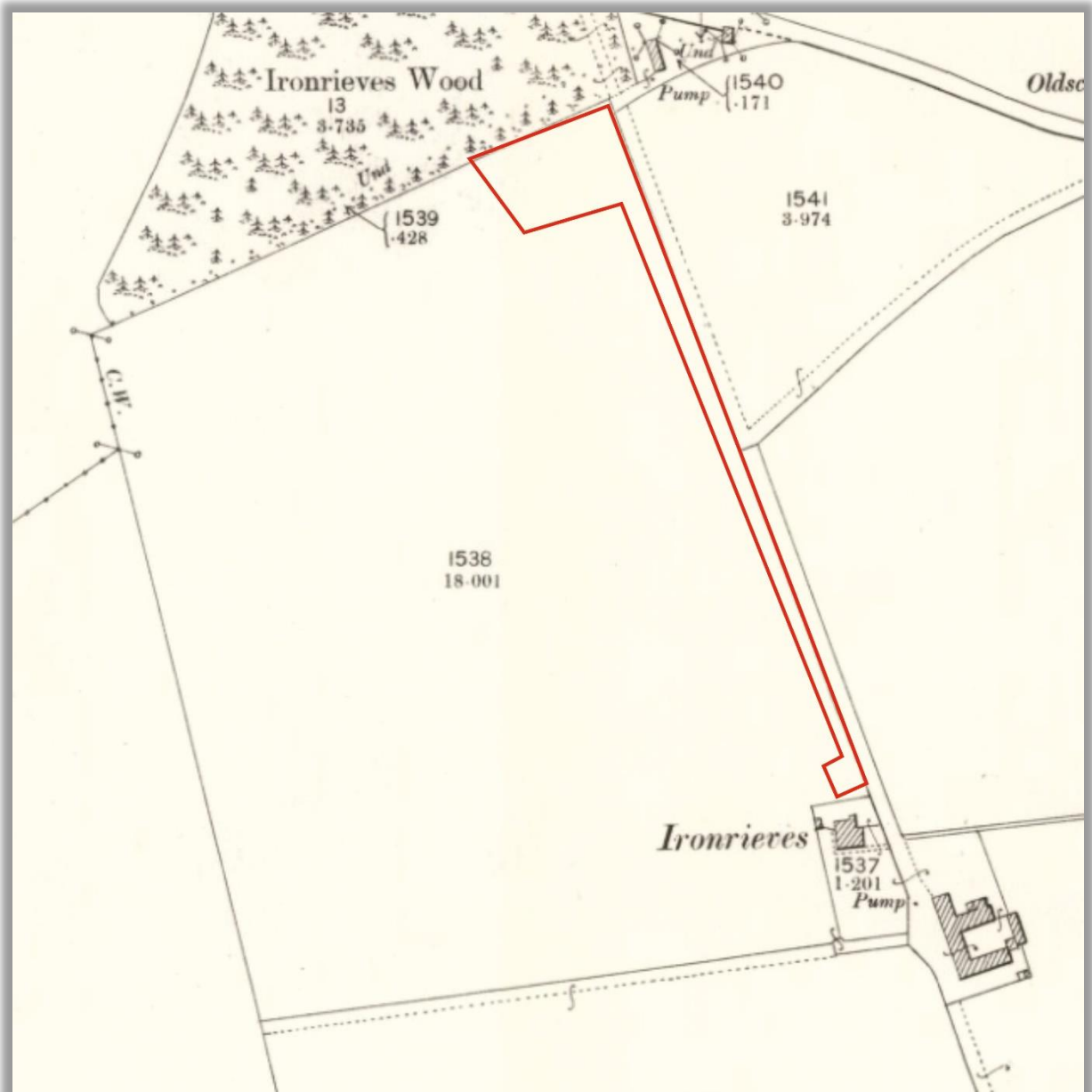
Illus 7 Second Edition OS map showing site outlined in red (copyright National Library of Scotland) Aberdeenshire LVI.2 (Belhelvie; Foveran; Udney) Publication date: 1900 Revised: 1899.