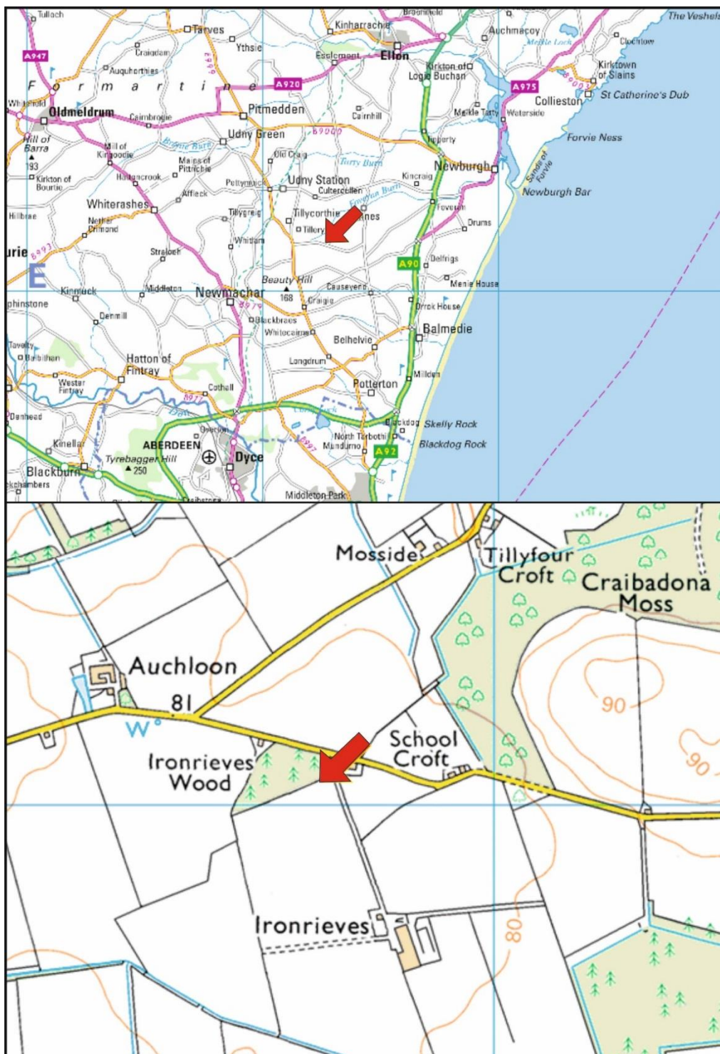
Illus 1 Location plan (Contains Ordnance Survey data © Crown copyright and database right 2019).