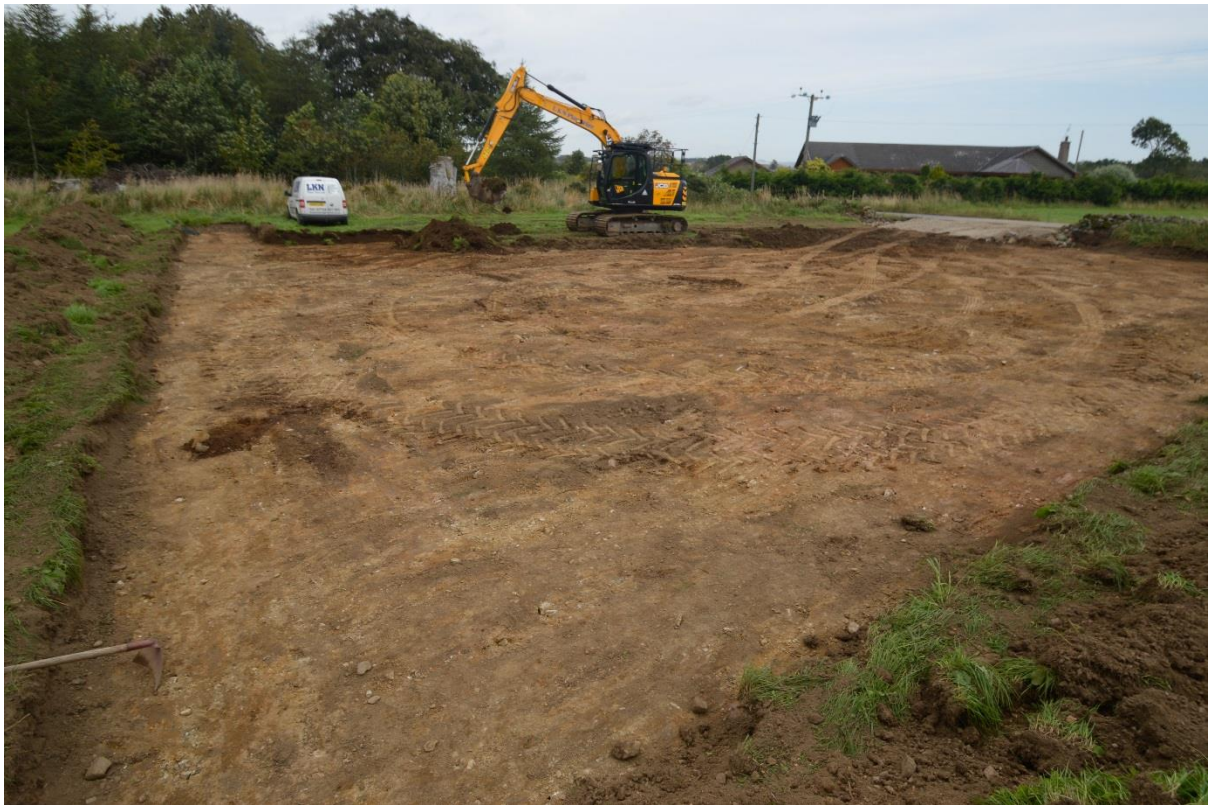
Illus 4 The watching brief area nearing completion.