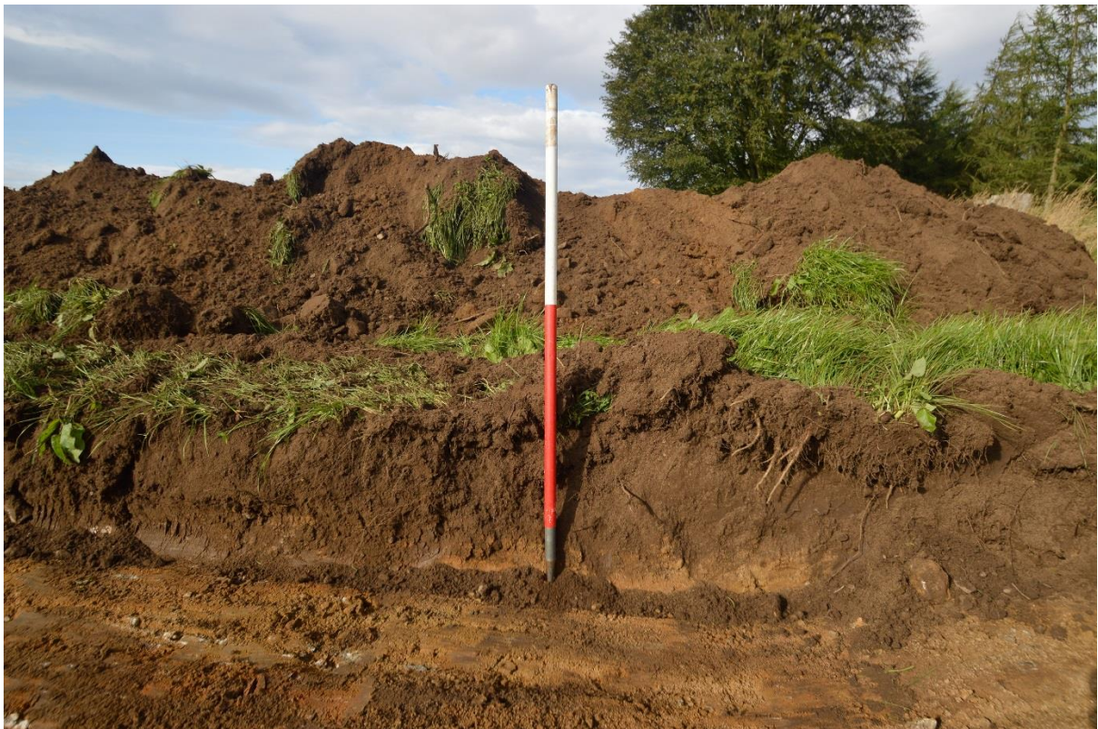
Illus 5 The topsoil depth remained consistent throughout, with the minimum/maximum depths between 250-320mm.