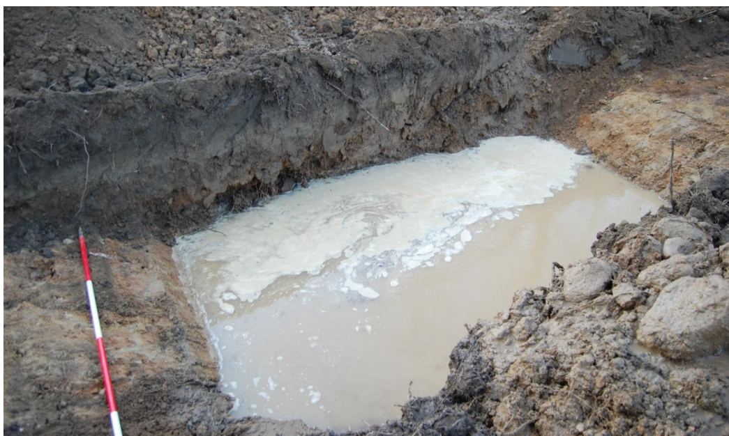
Illus 4 Canal excavated in field south of Stoneywood Terrace (Cameron 2012).