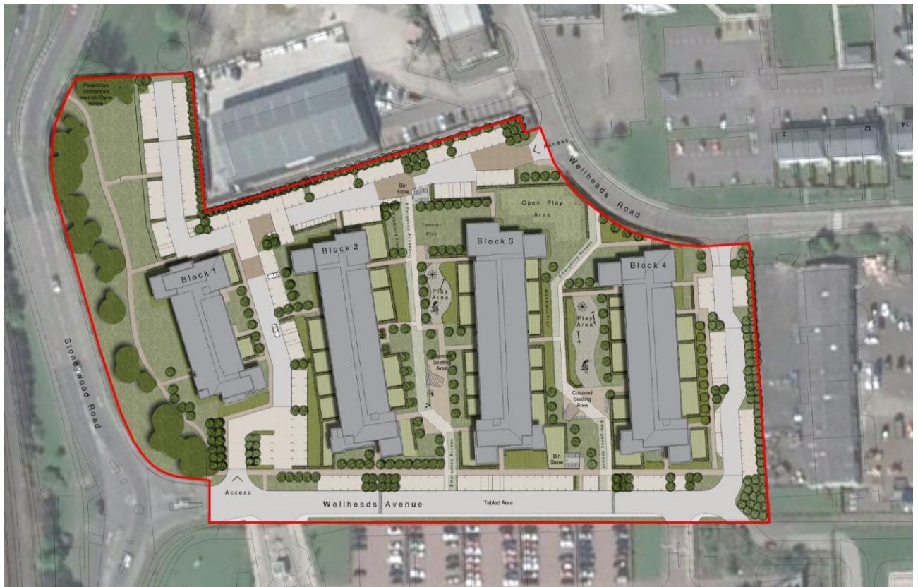
Illus 2 Location of proposed development (copyright Ogilvie Construction Ltd).