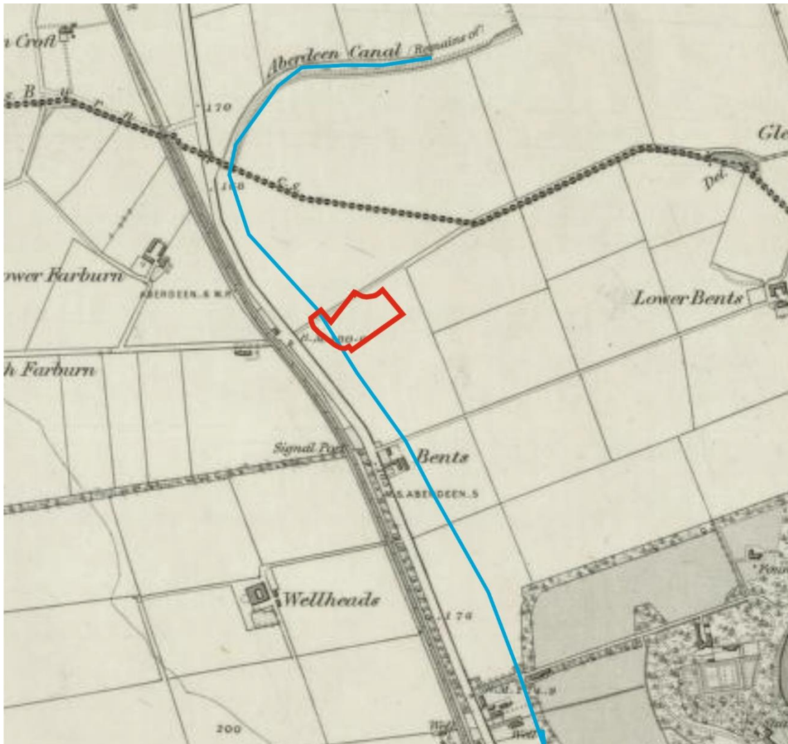
Illus 3 First Edition Ordnance Survey map showing approximate area of site in red and the possible line of the canal in blue (based on location of canal in Stoneywood Road sites; Cameron 2012). Aberdeen Sheet LXVI.13 (Combined) Survey date: 1864 Publication date: 1869.