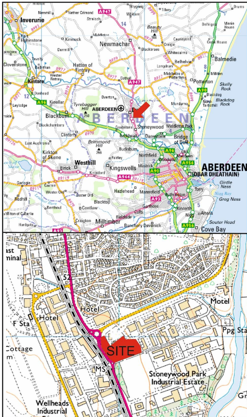
Illus 1 Location plan of site (Contains Ordnance Survey data © Crown copyright and database right 2019)