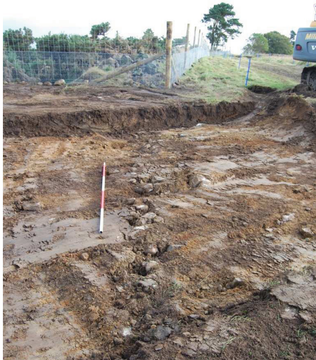
III 3 Feature F1, facing NE