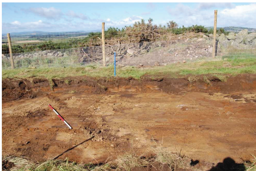
III 4 Feature 2 facing N