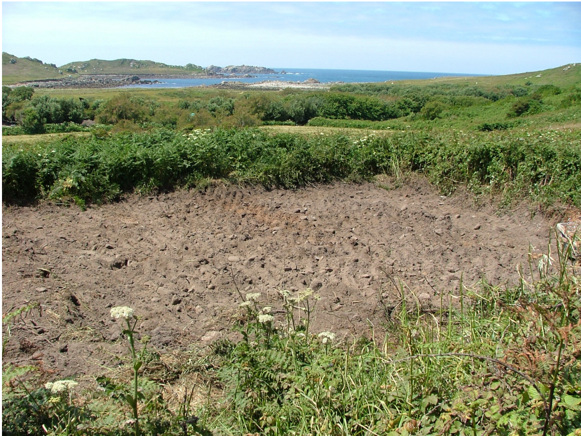
Fig 2 The septic tank site after soil stripping