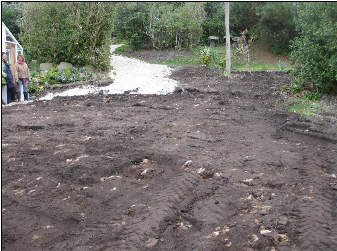
Fig 2 The development area after soil stripping viewed from the north-east