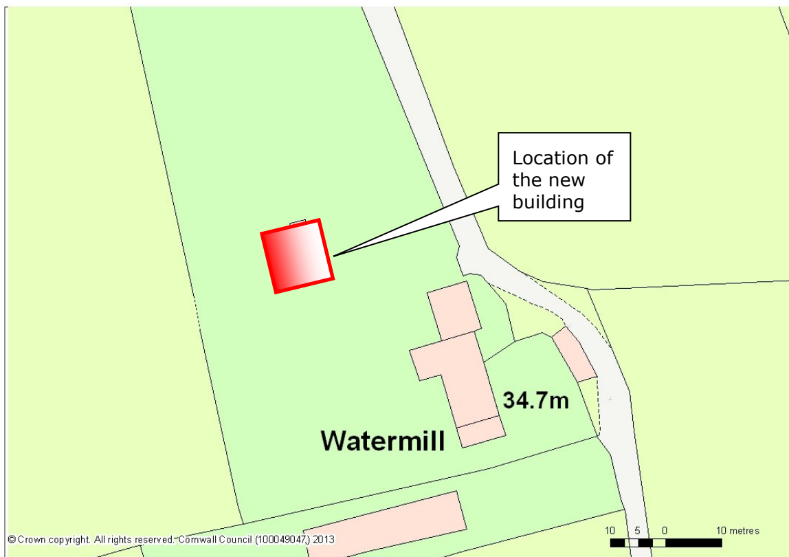
Fig 2 Site plan