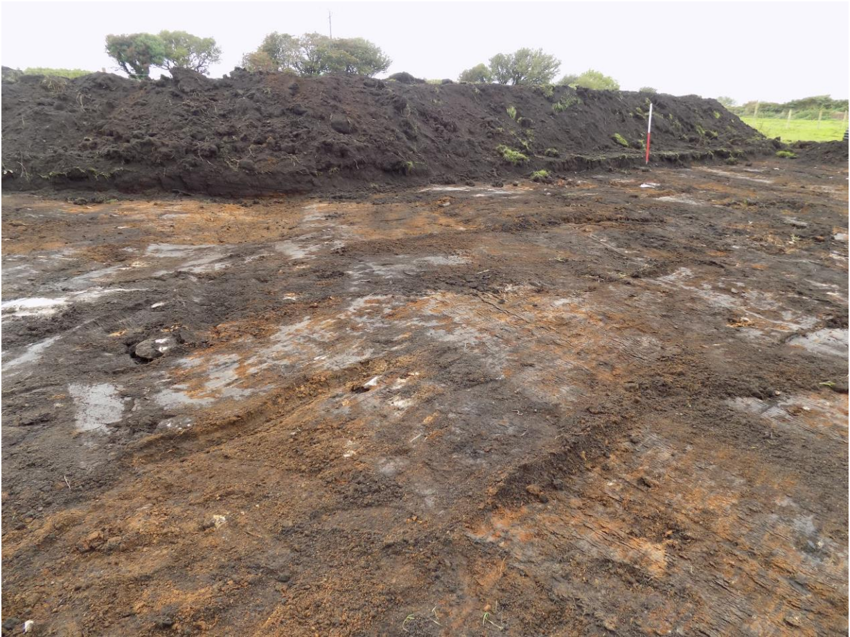
Figure 3. Field 2. View showing the typical soil profile that was encountered in all the fields examined