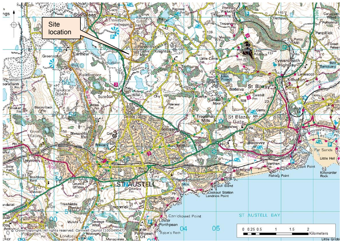
Figure 1. Site location