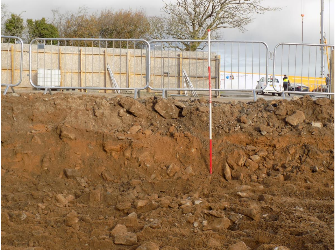
Figure 3. View showing the typical profile that was encountered with up to 0.5m of made ground overlying the natural bedrock.