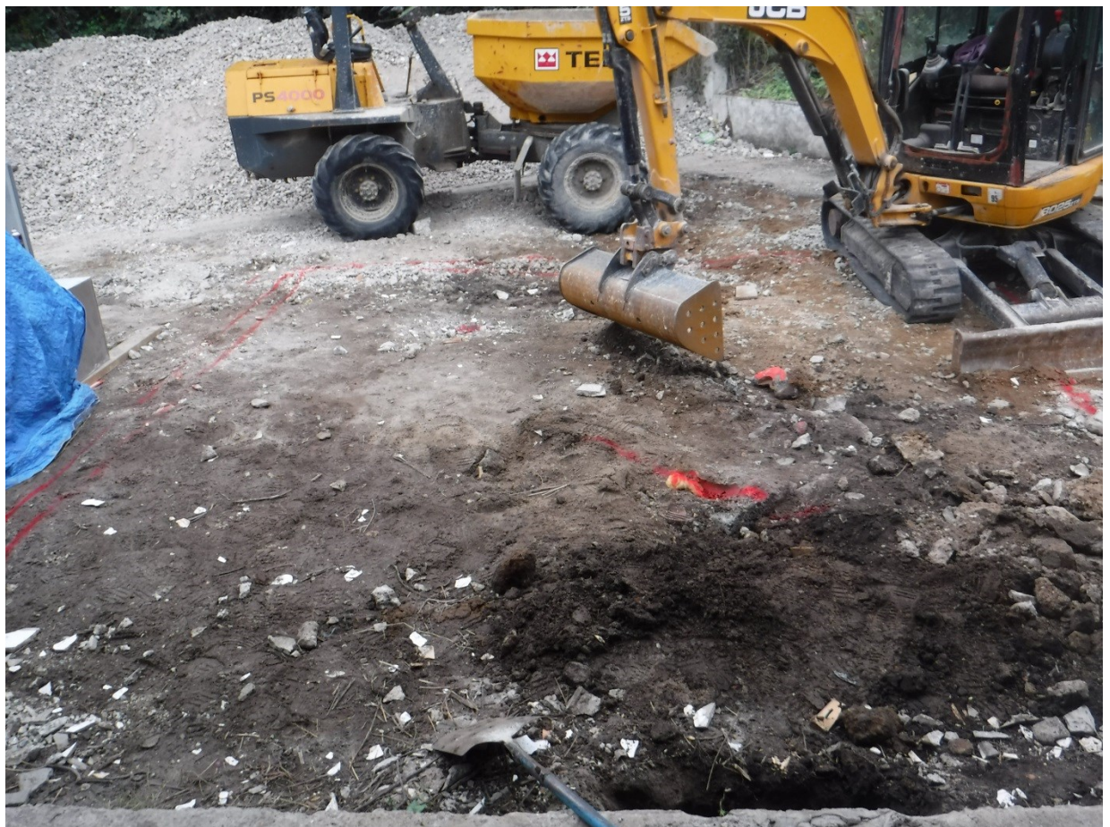
Fig 2 The site prior to excavation.