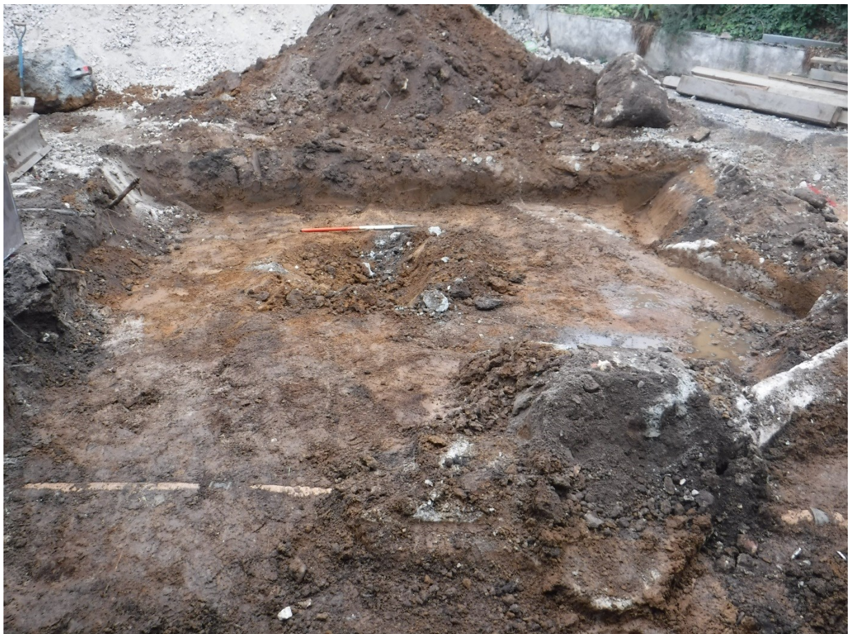
Fig 4 The site after excavation.