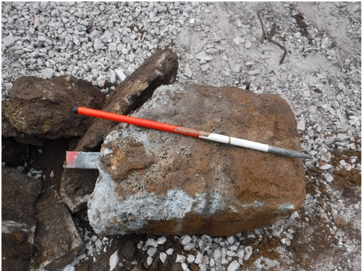
Fig 3 Post-pad for the bike shed roof support.