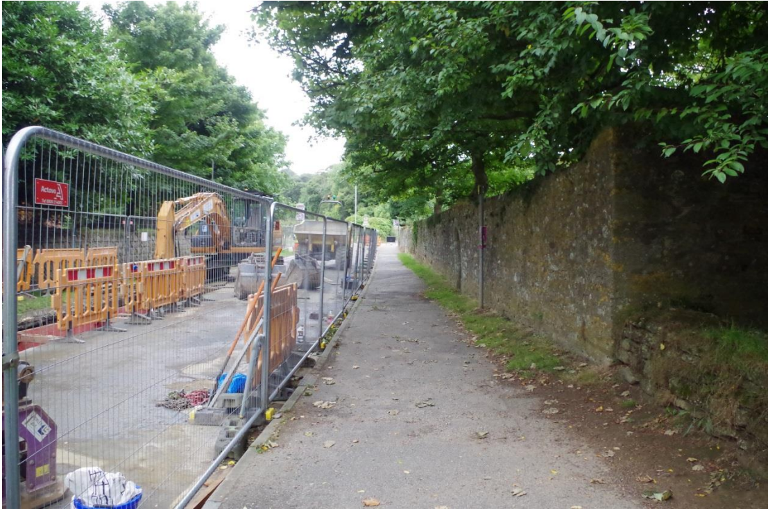
Figure 3. Photograph showing relationship of sewage trench (to left) to the wall of the Quaker Cemetery (at right).