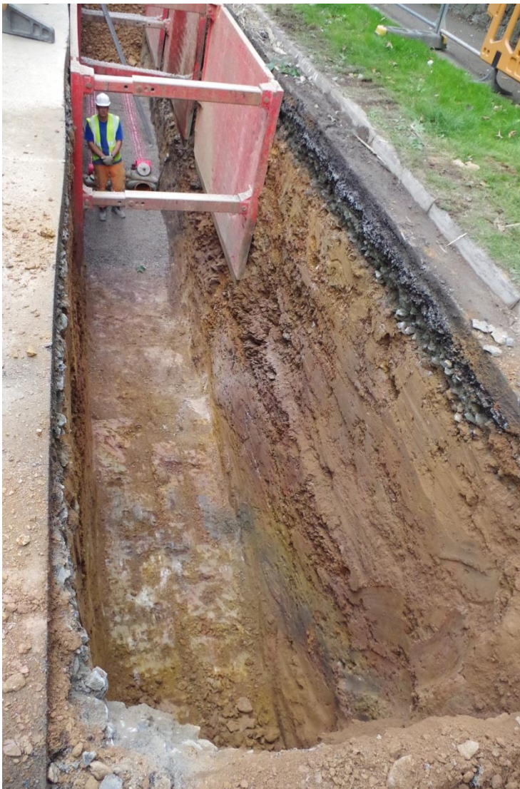
Figure 4. Typical Section through trench (Section 3) showing the nature of the ground.