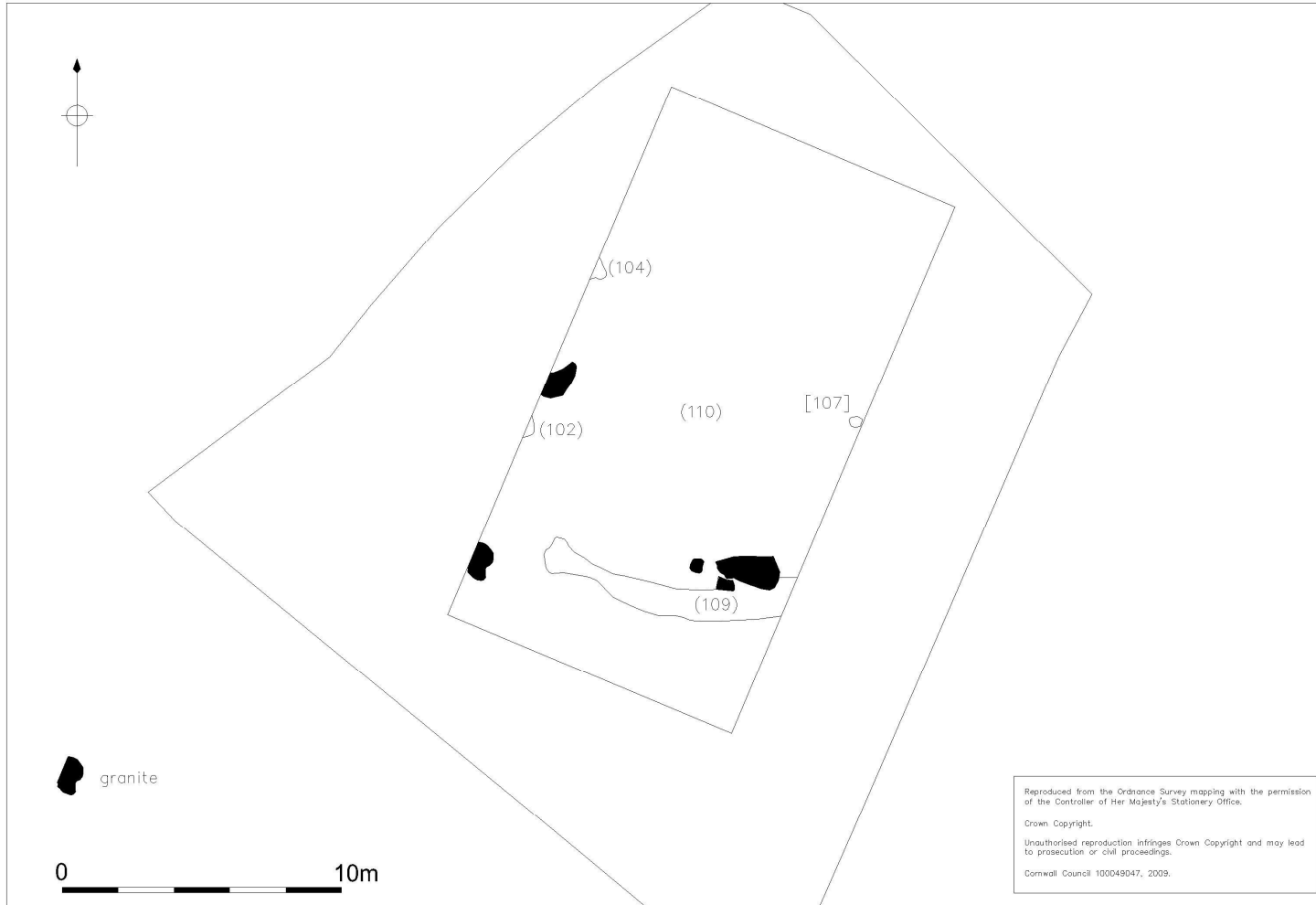
Figure 2: Site plan