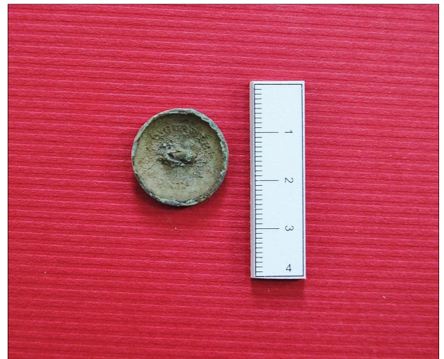
Plate 6 Find No. 31 – copper alloy button, back