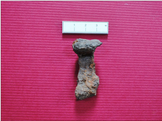
Plate 3 Find No. 7 – small unknown iron object