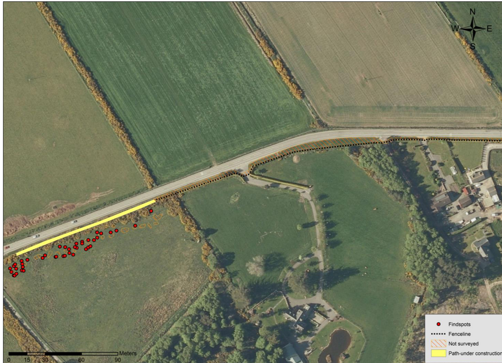
Figure 2 Location of survey and findspots 3