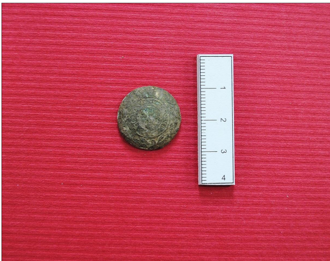
Plate 5 Find No. 31 – copper alloy button, front