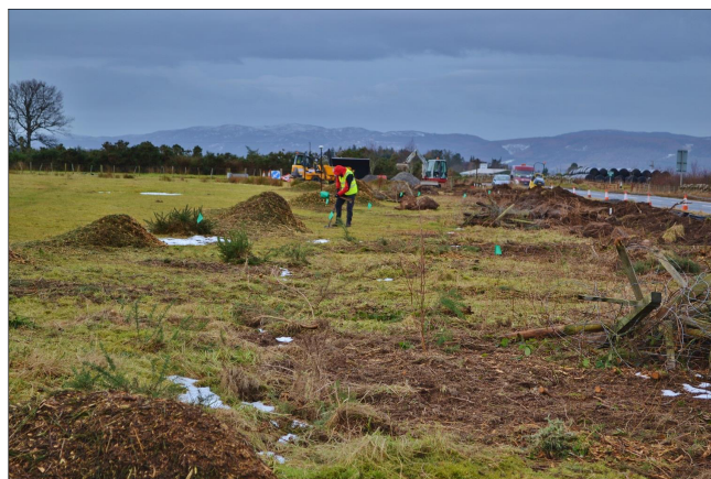
Plate 2 Metal-detecting in progress, facing W