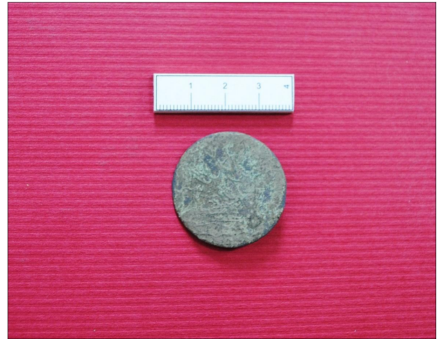
Plate 4 Find No. 19 – copper alloy button