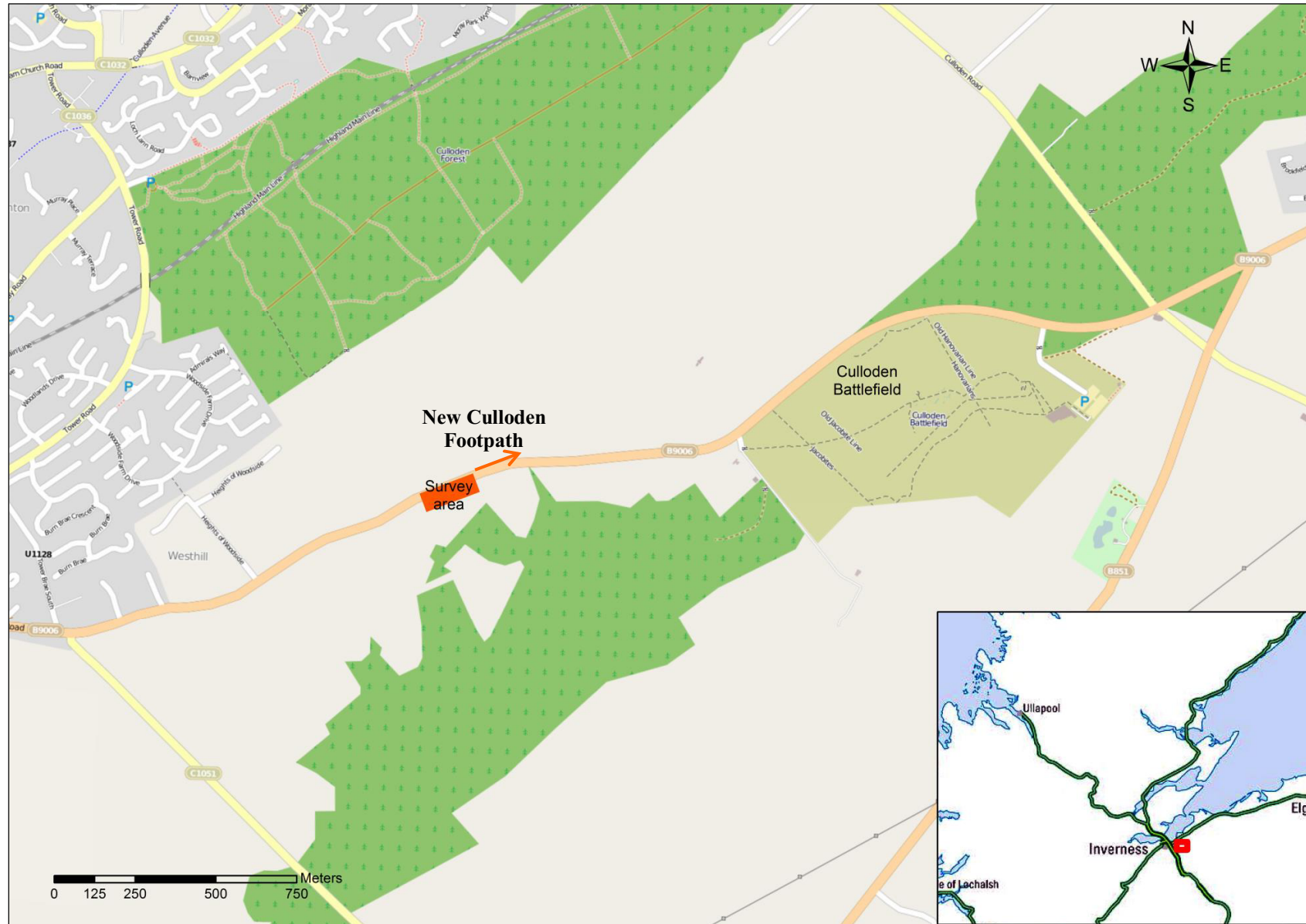
Figure 1 Location of metal detector survey area 2