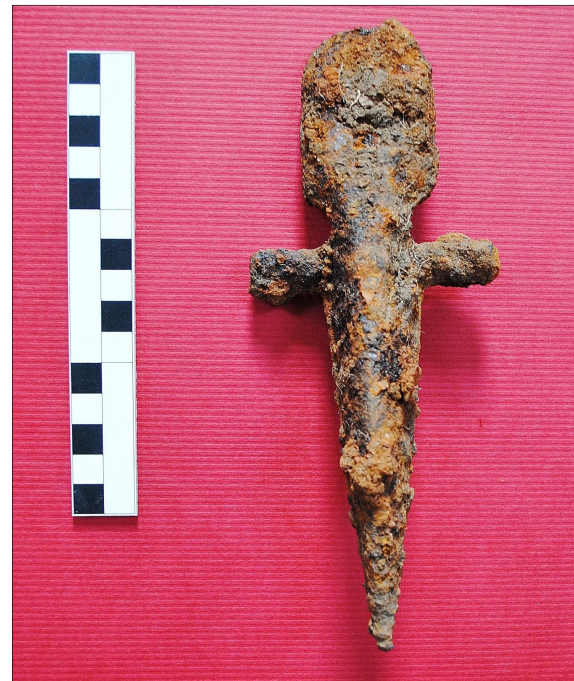
Plate 10 Find No. 30 – possible farm machine part