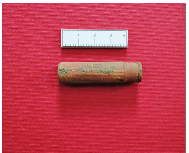
Plate 8 Find No. 34 – small lipsticker container