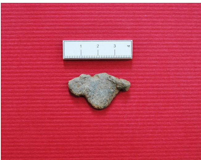
Plate 7 Find No. 32 – Lead or pewter object