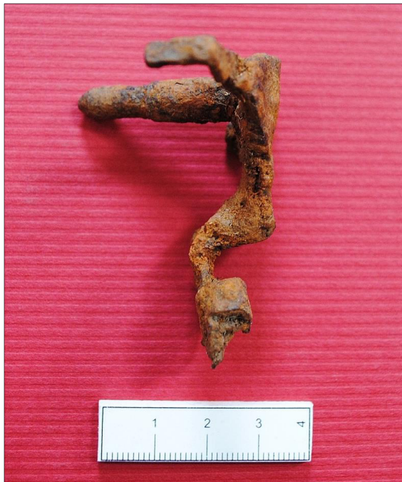
Plate 9 Find No. 23 – iron fastening or mechanism