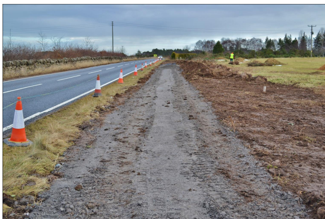
Plate 1 Culloden Footpath on 8 Feb 2013, facing E