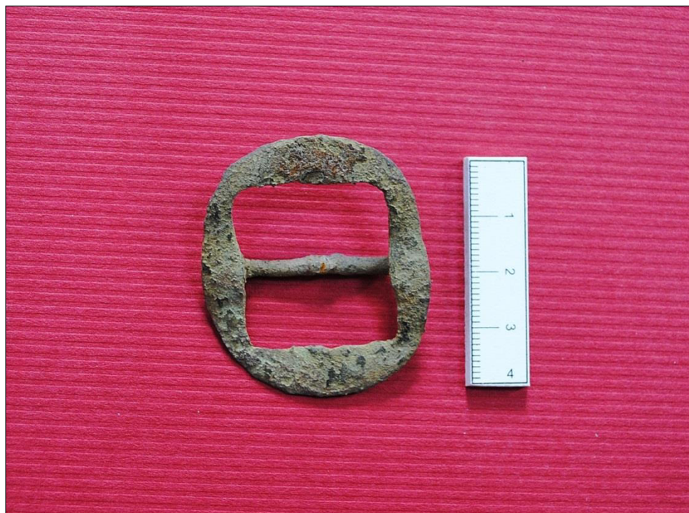
Plate 11 Find No. 28 – copper alloy buckle

Roberts, N A, Brown, J W, Hammett, B and Kingston, PDF 2008 A detailed Study of the Effectiveness and Capabilities of 18 th Century Musketry on the Battlefield in Journal of Conflict Archaeology , Vol 4: 1-21