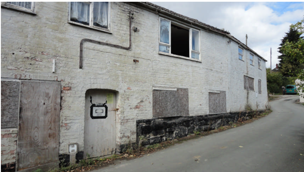
Photo 2: The east range of buildings on the street frontage, looking northwest