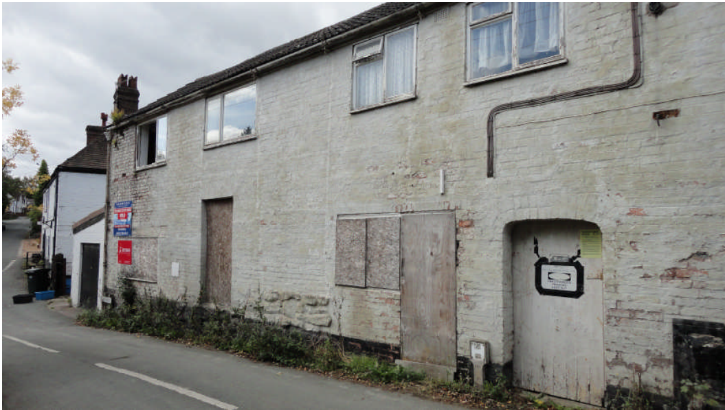
Photo 1: The south end of the street frontage buildings, looking southwest