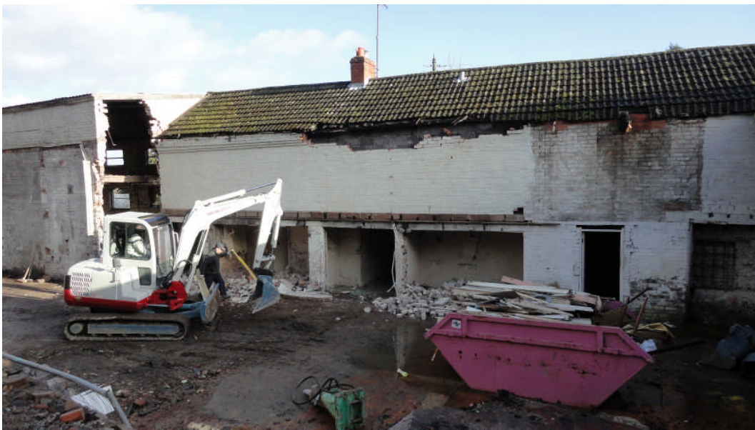
Photo 5: The rear of the buildings on the street frontage, looking northeast