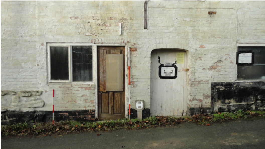
Photo 4: Doorway on the street frontage, with stone work to either side; (scales 2m and 1m)