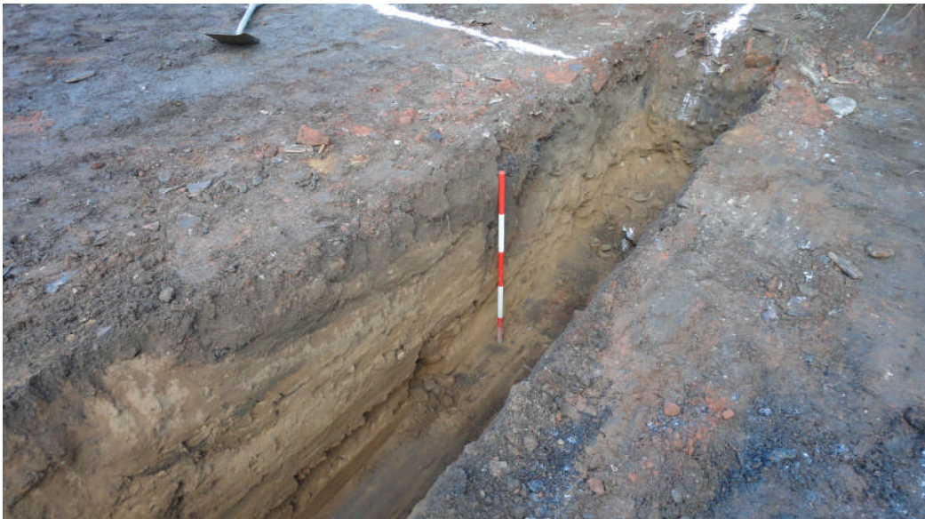
Photo 2: Deposits in the northeast corner, looking northwest (scale 1m)