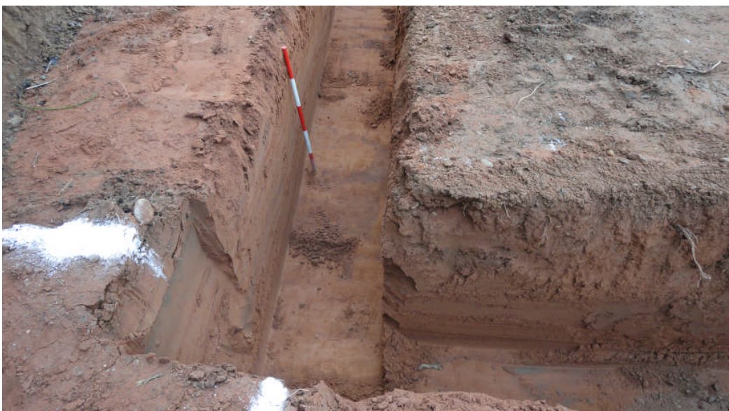
Photo 3: Deposits in the southeast corner, looking west (scale 1m)