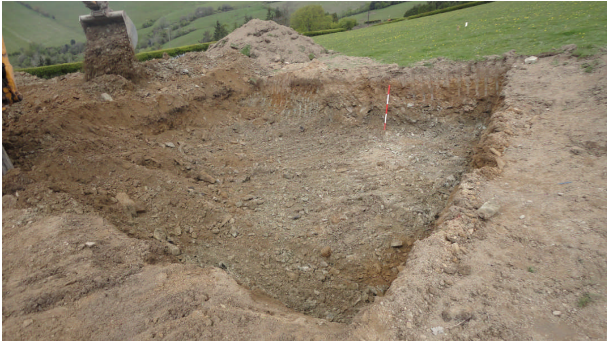
Photo 1: The excavation for the turbine base at Three Birches, looking NW, scale bar 1m