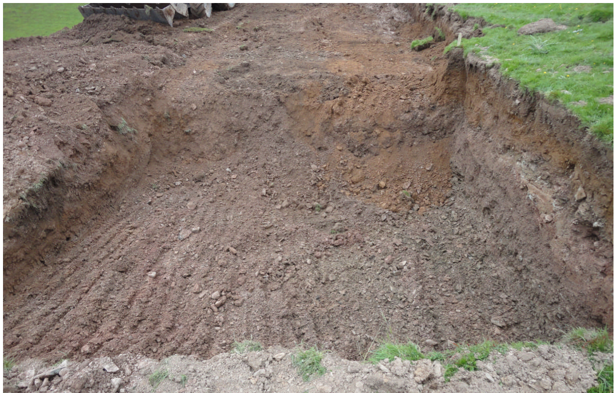
Photo 2: The excavation for the turbine base at Two Crosses, looking NW