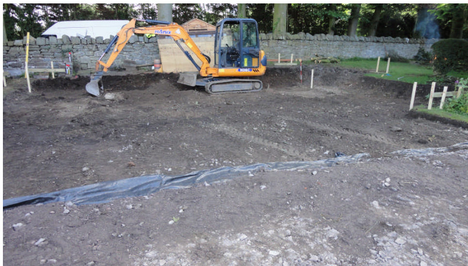
Photo 3: The site of the garage, stripped of topsoil, looking SE (scale bar 1m)