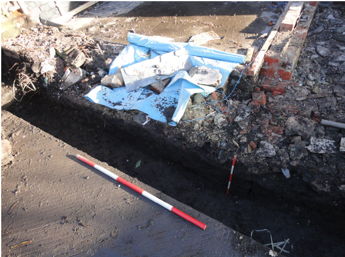
Photo 2: The western foundation trench, looking NE, scale bars 0.5m & 1m