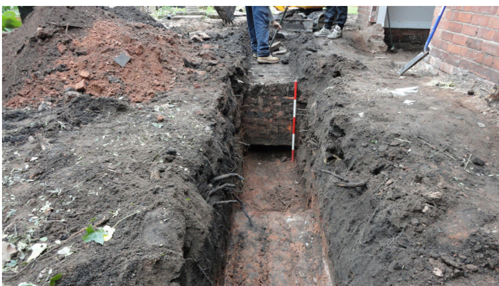
Photo 3: The well cap in the foundation trench, looking W; scale bar 1m