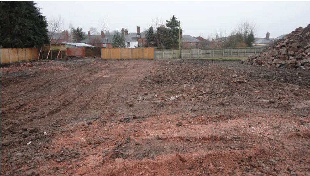
Photo 2: The northeastern part of the development site, looking SE