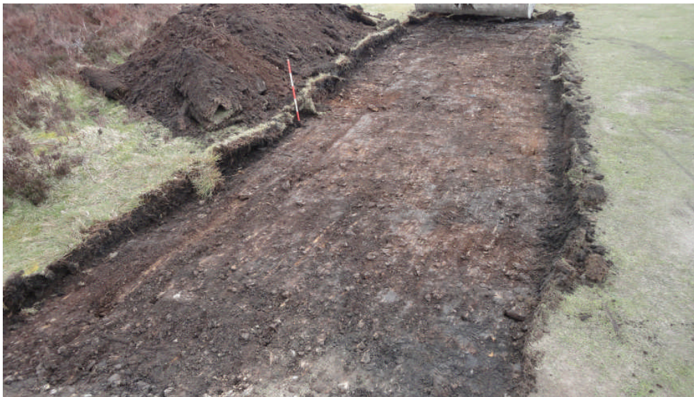
Photo 2: The north end of the cut for the new path, looking S; scale bar 0.5m