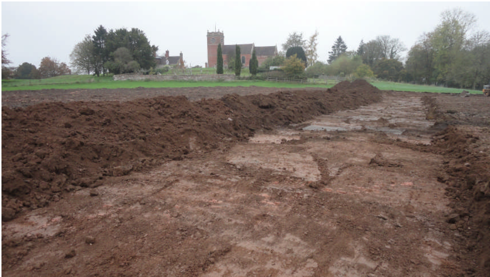
Photo 2: The development site during the topsoil strip, looking NW