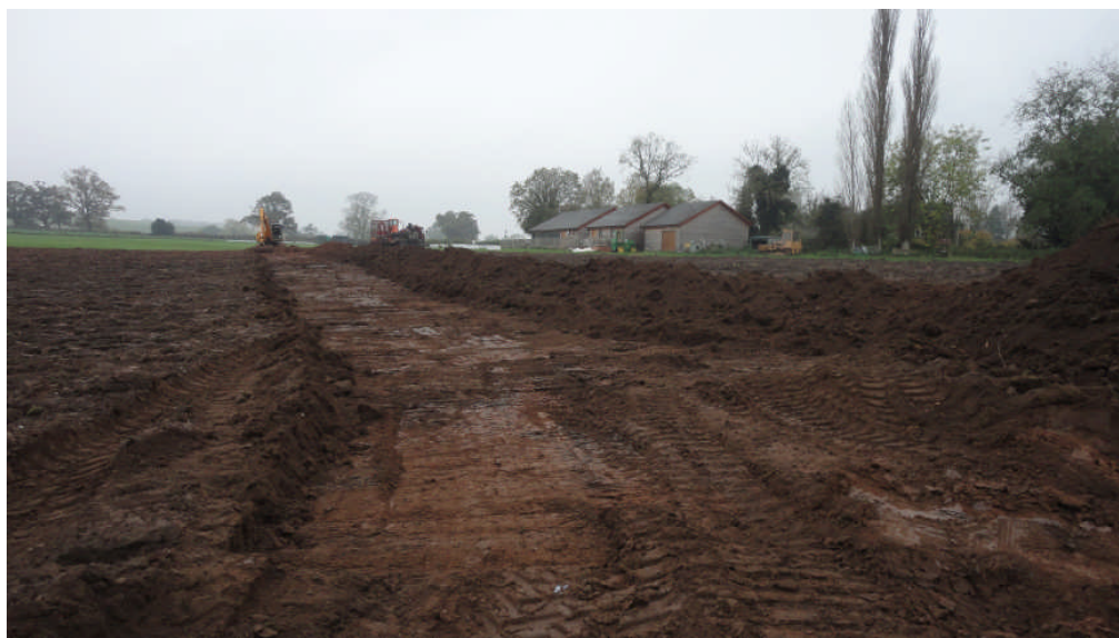
Photo 3: The development site during the topsoil strip, looking SW