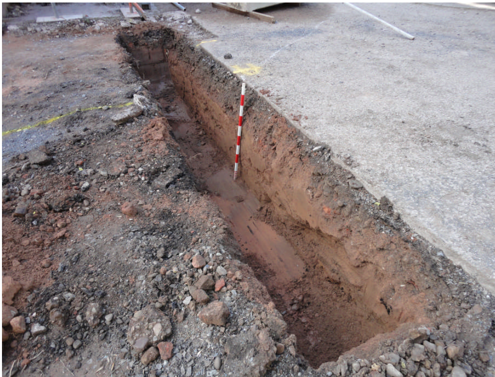
Photo 2: The foundation trench for the W side of the garage, looking SW; scale bar 1m