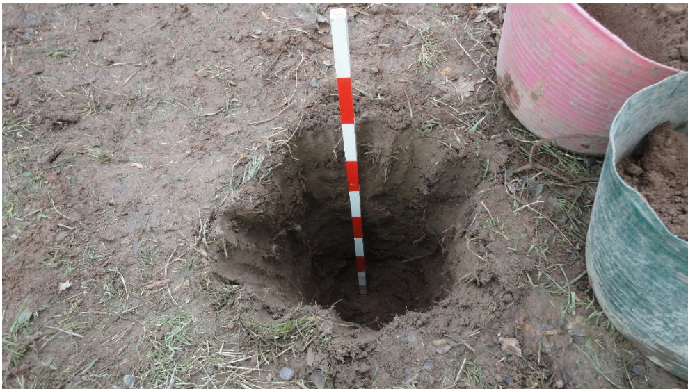
Photo 5: Cwm Farm; the gate post hole on the SE corner of the gate, looking N; scale bar 1m