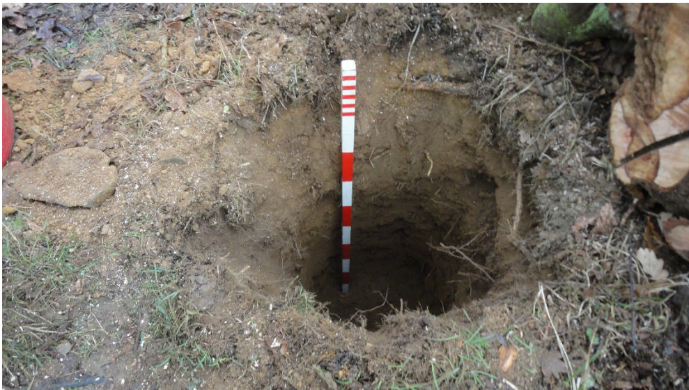
Photo 2: Bridge Farm; the gate post hole on the NE corner of the gate, looking NE; scale bar 1m