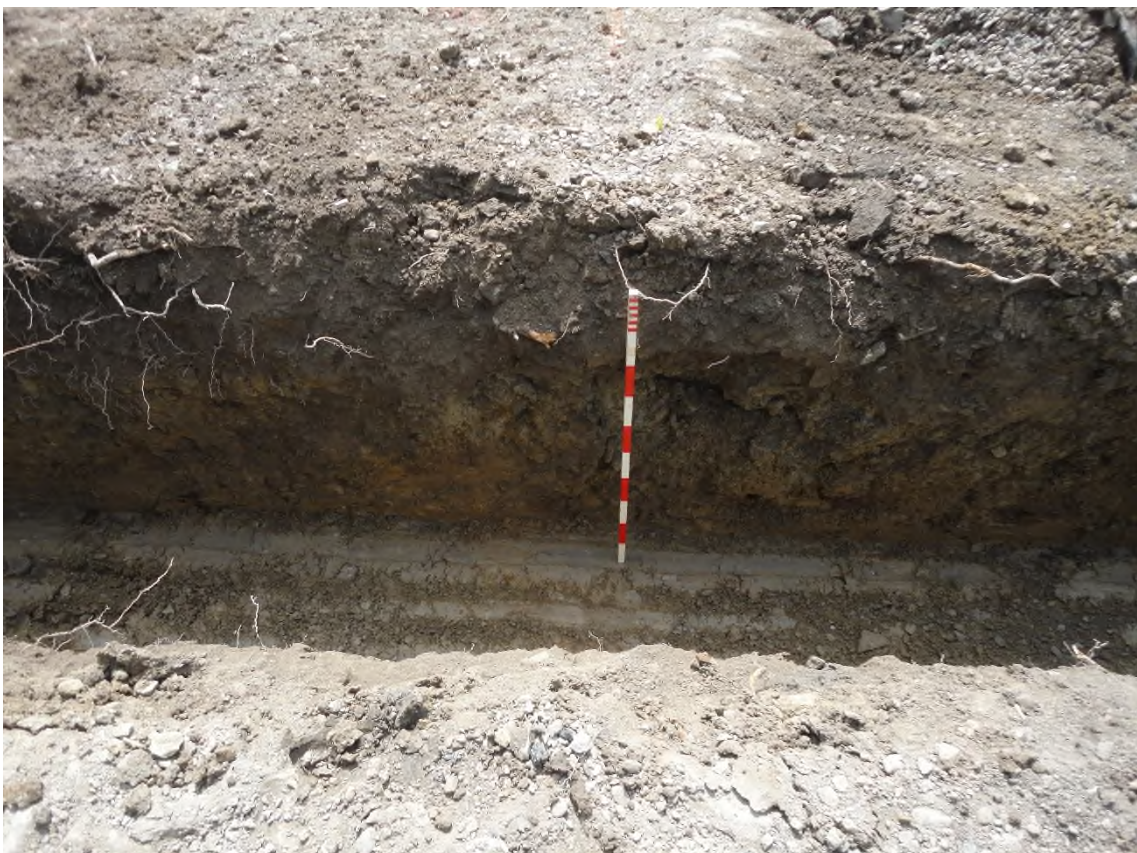
Photo 2: One of the foundation trench, showing the garden soil and the natural clay, looking S