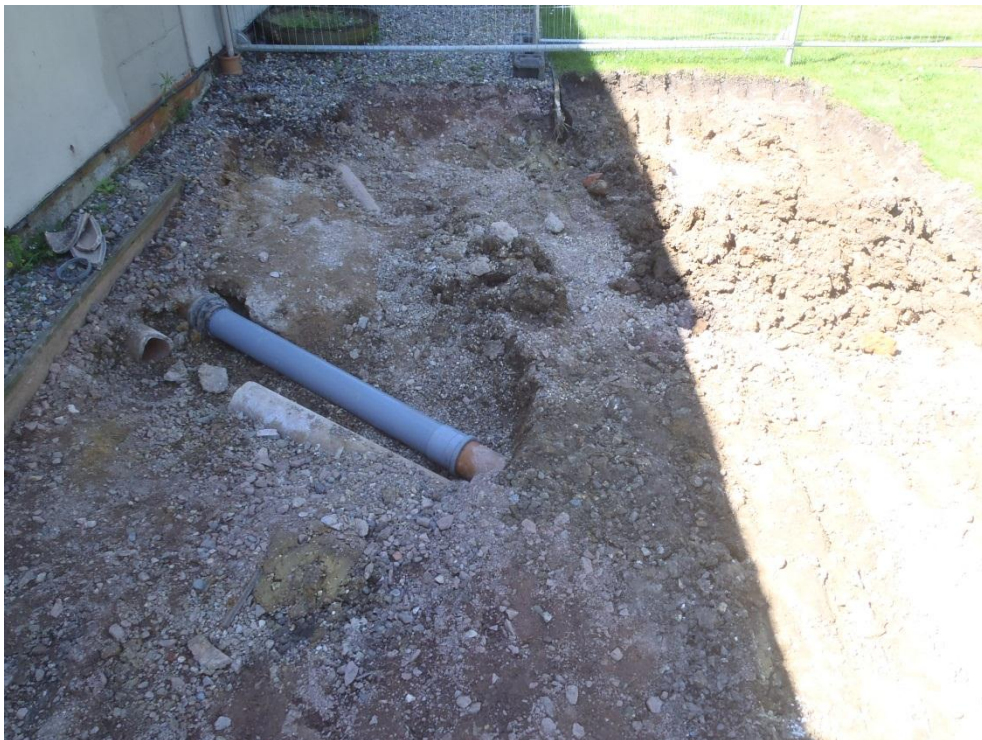
Plate 2: General view of modern services looking north