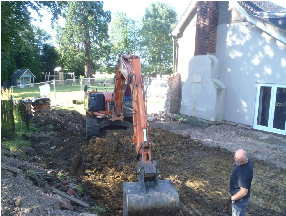
Plate 1: General working view looking southwest