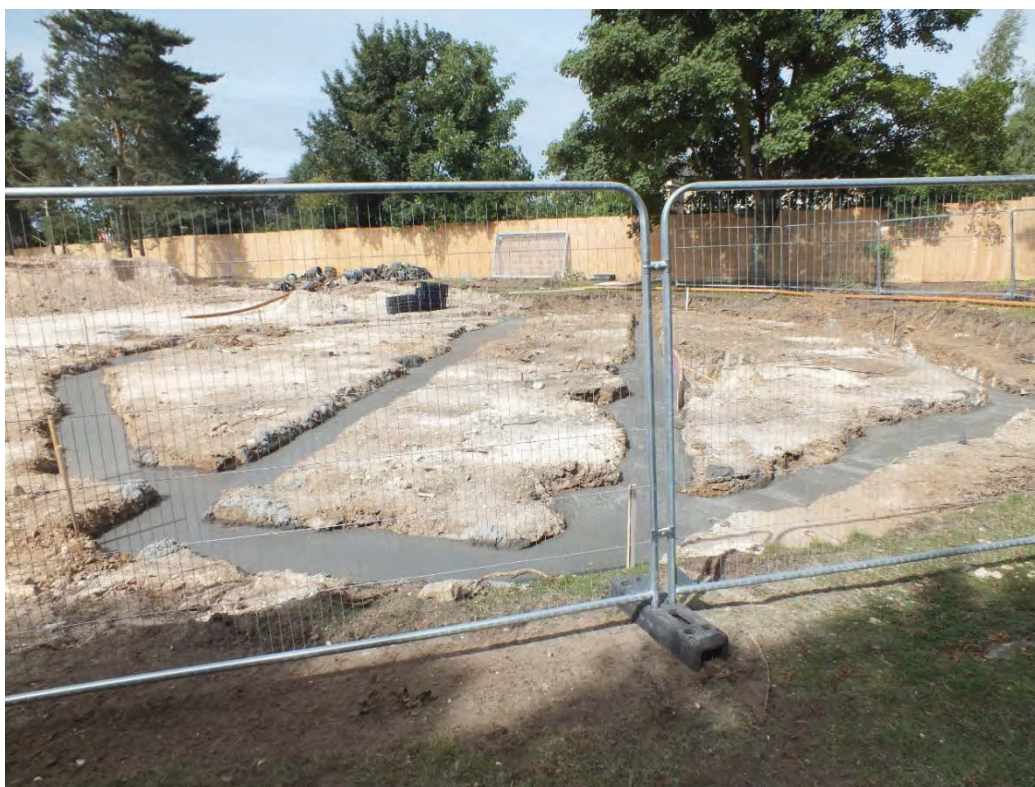
Plate 4: Foundations of 'wellbeing centre', view north