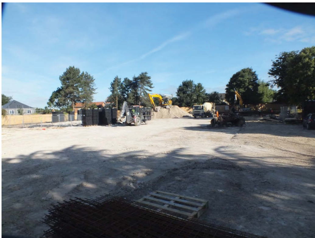
Plate 3: View of site from south-east