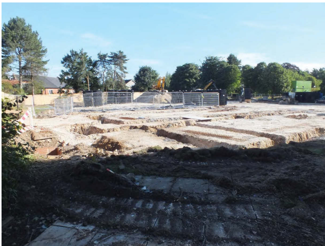
Plate 1: View of site from south-west corner