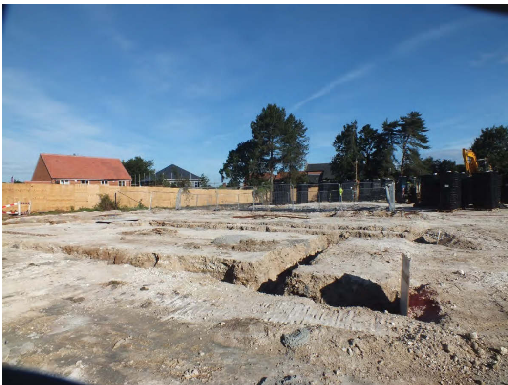
Plate 2: view of site from south-east