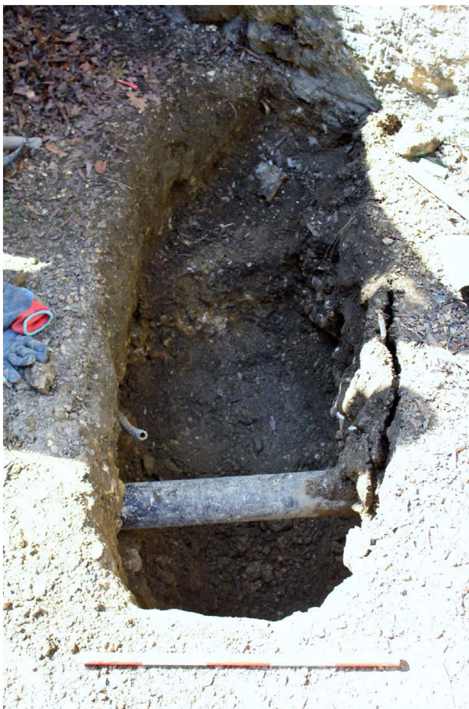
Plate 2: Eastern drain trench, view west