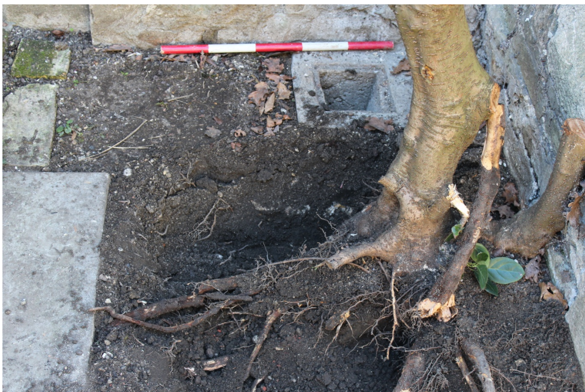
Plate 4: Depth of drain trench on northern elevation, view south-west