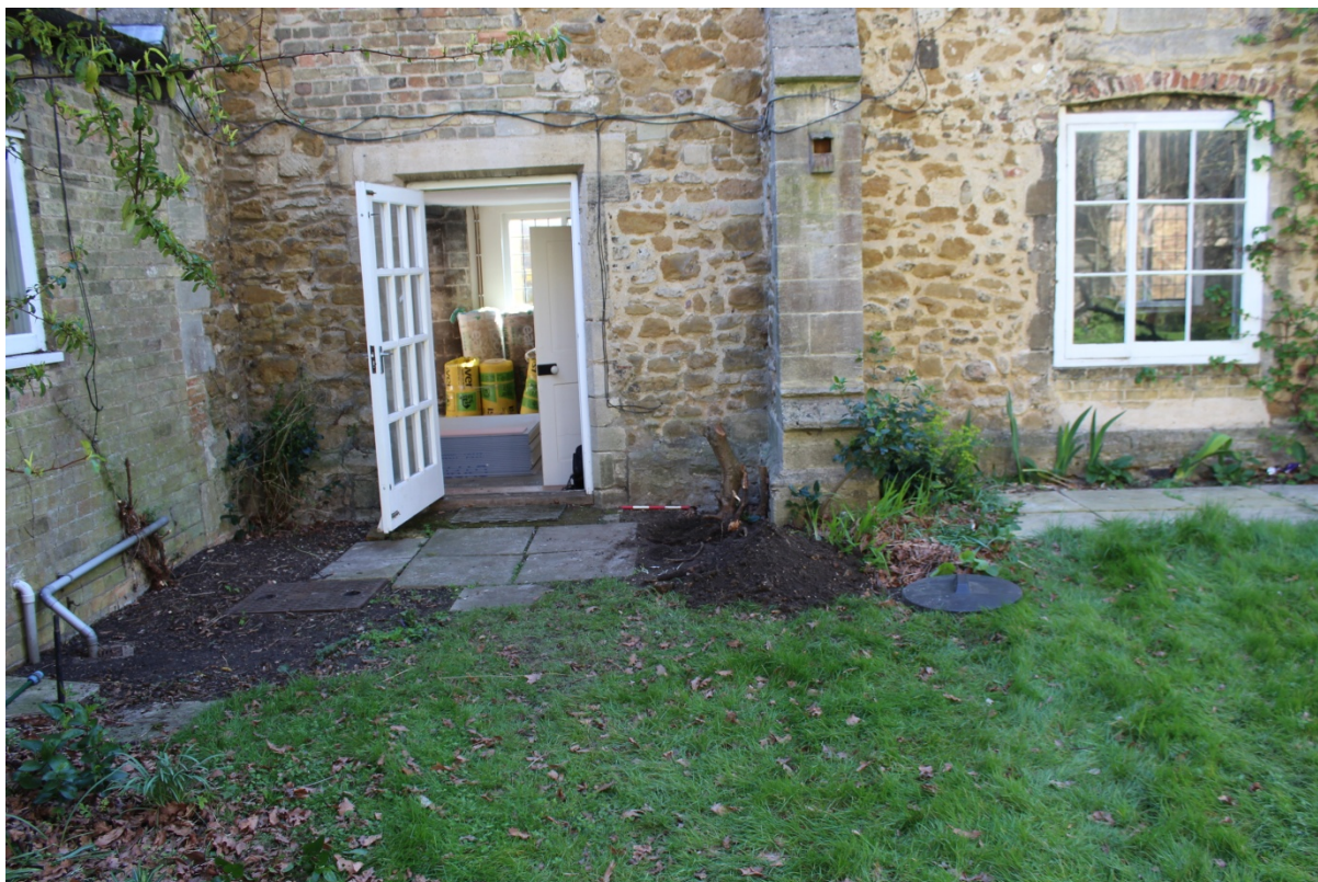
Plate 3: Area monitored on northern elevation, view south-west