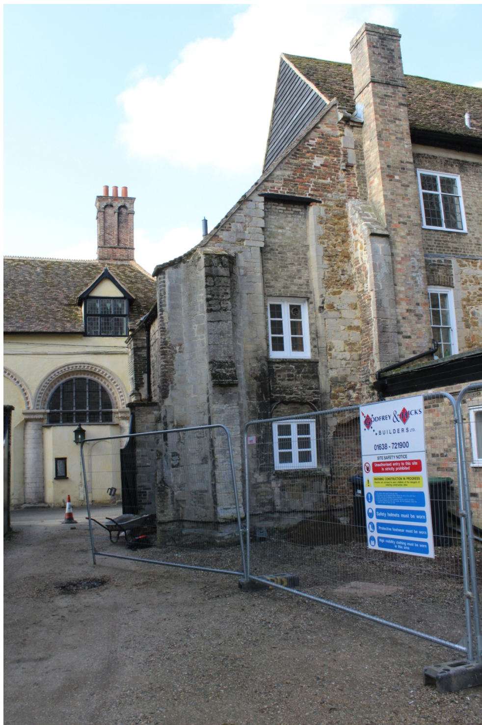
Plate 1: Powcher's Hall east elevation, view south