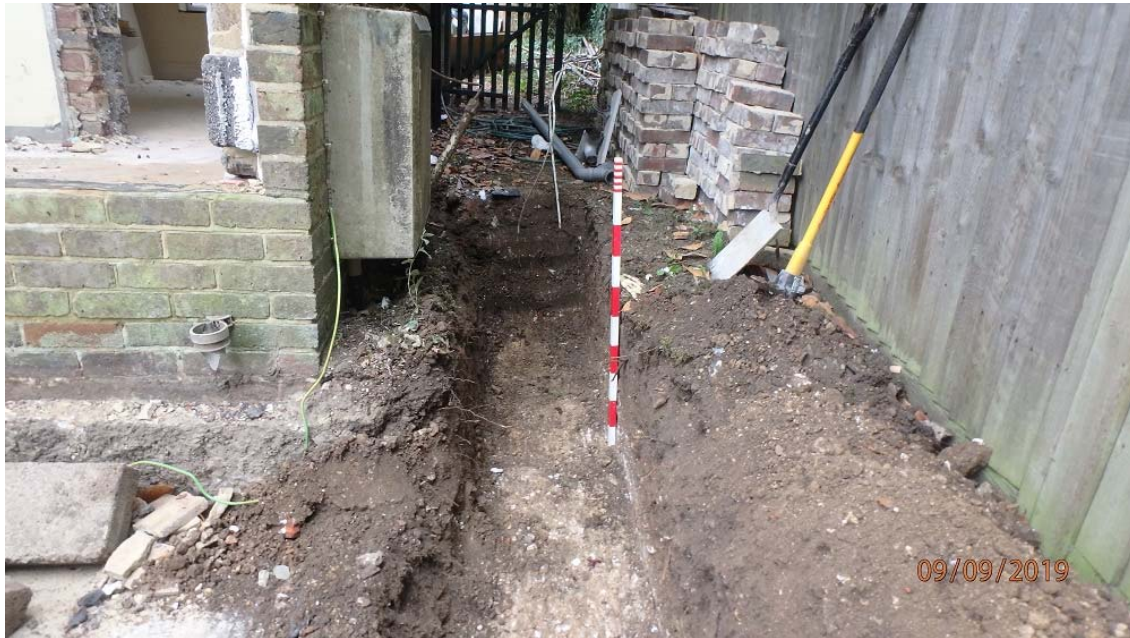
Plate 7. Excavation for new drainage adjacent to northern site boundary, view west. Scale 1m.