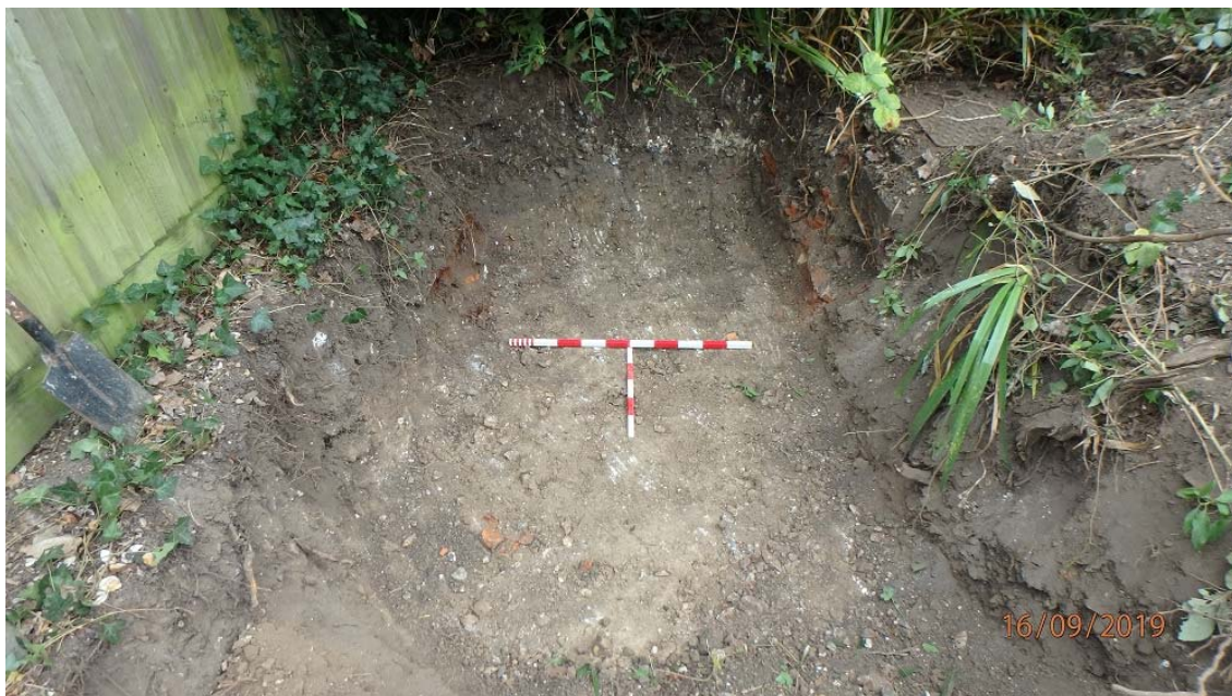
Plate 8. Excavation for new soakaway adjacent to northern site boundary, view east. Scales 1m & 0.5m