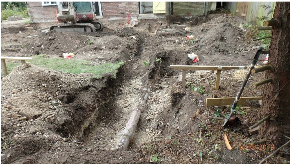
Plate 6. Existing drainage exposed beneath and east of proposed extension, view west.