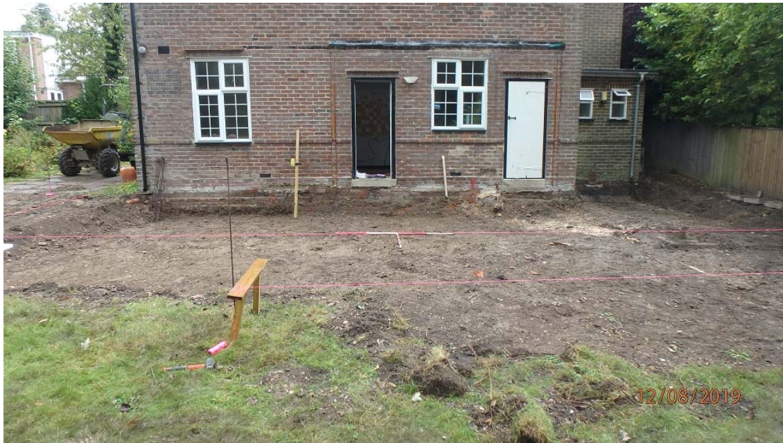
Plate 5. Proposed extension footprint reduced level, view west. Scales 2m & 1m.