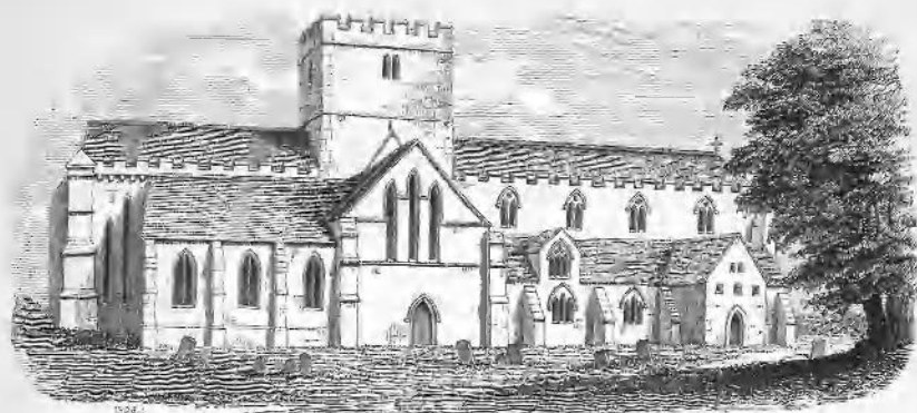
North View of St. John the Evangelist, Brecon.