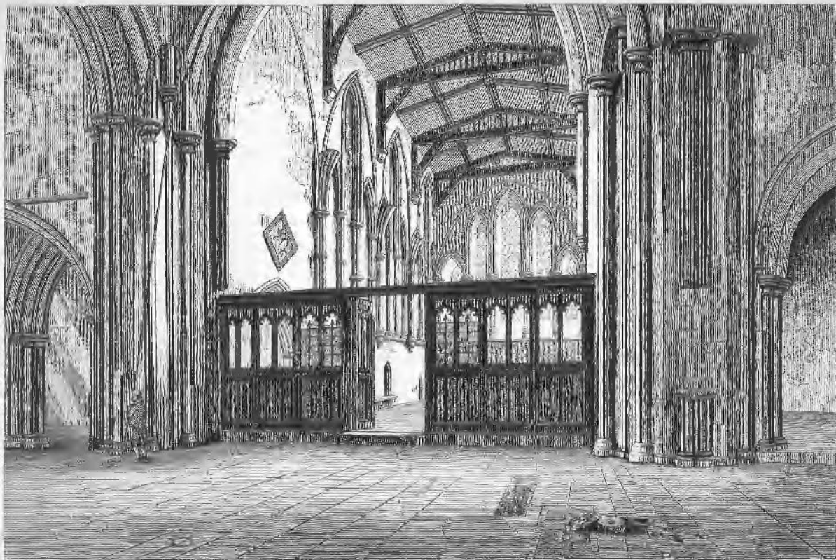
Interior of the Friary of St. John the Evangelist, formerly the Church of the Holywood.